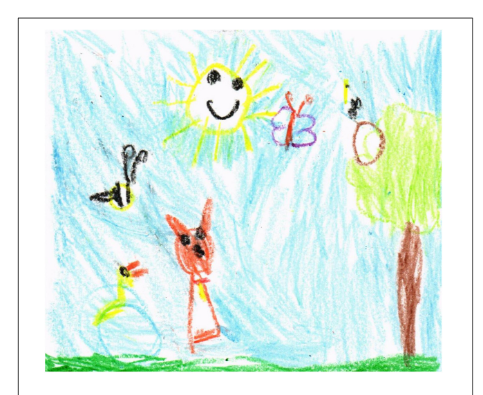
FIGURE 4 | Drawing with support system.

The use of art as tool of data collection proved to be an effective technique for the externalization of the participants' ideas regarding the studied phenomenon. This demonstrates children's deep understanding of the concept of nature.