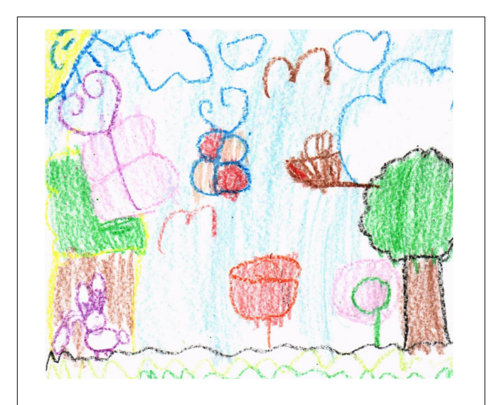
FIGURE 3 | Drawing with proper symbolic representation.