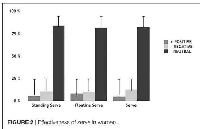
FIGURE 2 | Effectiveness of serve in women.

In the case of block, no significant gendered differences in accuracy were found ( z = -0.881 ; p = 0.378 ) but a significantly higher number of errors were found in female players ( z = -3.315 ; p = 0.001 ). Significantly higher accuracy was also found between U-21 and U-18 ( z = -4.143 ; p = 0.001 ), U-19 ( z = -3.218 ; p = 0.001 ), U-20 ( z = -4.226 ; p = 0.001 ), and U-22 ( z = -4.362 ; p = 0.001 ).