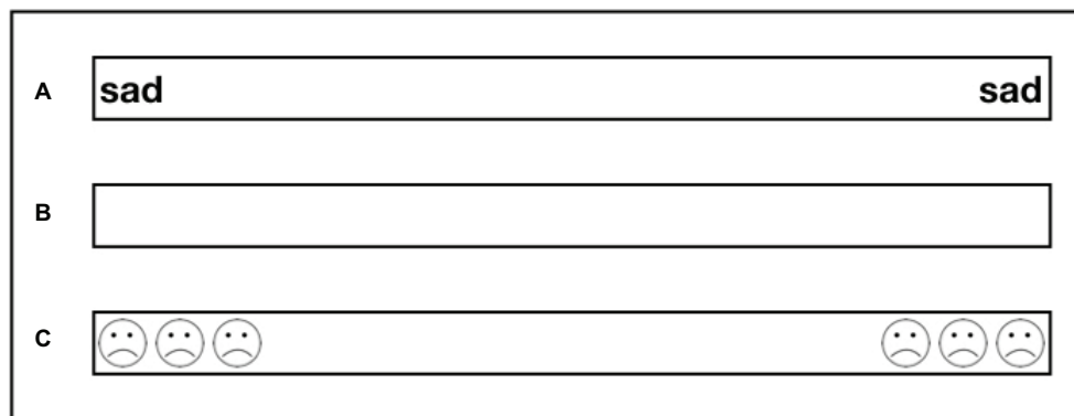
FIGURE 2 | Illustration of the various line types. (A) Horizontal negative word line; (B) Horizontal blank line; (C) Horizontal negative smiley line.

and neutral smileys (see Figure 2 for an example of the different line types). Each line type was presented eight times in each axis. In total, each subject was asked to bisect 168 lines [21 conditions (3 axes \times 7 line types) \times 8 repetitions for each condition]. Following the method used by Schenkenberg et al. (1980), all 8 repetitions of each of the 21 conditions were printed on an A4 paper with a distance of 1.8 cm between each line and were presented randomly at a distance of 30 cm from the subjects. The measurements were done using ABSOLUTE Digimatic Caliper with an accuracy of 0.001 cm (Mitutoyo, 2016). The point of bisection was measured twice for each line, and the two measurements were averaged. The measurements were as follows: the distance from the left for horizontal lines, the distance from the top for vertical lines, and the distance from the distal end for the radial lines.