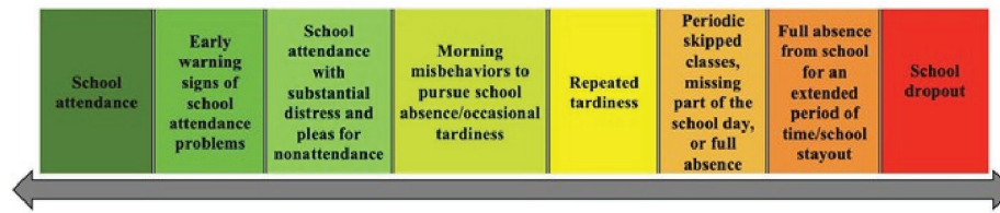
FIGURE 1 | Spectrum of school attendance and its problems.

distress, and morning misbehaviors designed to induce parental acquiescence or other responses that may eventually lead to absence from school (Kearney, 2019). Common early warning signs that may signal later absenteeism include frequent requests to leave the classroom or to contact parents, difficulties attending specialized sections of a school building (e.g., gymnasium, cafeteria), difficulties transitioning from class to class, persistent distress, and sudden changes in grades, completed work, or behavior, among others (Kearney and Graczyk, 2014).