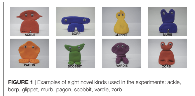
FIGURE 1 | Examples of eight novel kinds used in the experiments: ackle, borp, glippet, murb, pagon, scobbit, vardie, zorb.

For the properties, we decided to use imperceptible, non-obvious properties that could not be assessed on the basis of the visual features of our experimental creatures. Instead of using adjectives as Chambers et al. (2008) did, we used verbal predicates and embedded them under the dispositional verb “love” for maximum arousal and in order to make them more child-friendly. In order to identify possible properties, we used affective ratings from Warriner et al. (2013), who measured valence, arousal, and dominance for 13,915 English lemmas by collecting adult ratings on a 9-point scale. The three dimensions were valence (the pleasantness of the stimulus), arousal (the intensity of emotion provoked by the stimulus) and dominance (the degree of control exerted by the stimulus). Examples of the database at the extreme ends include the following: pedophile (lowest valence: 1.26), vacation (highest valence: 8.53), grain