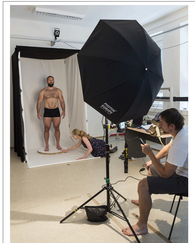
FIGURE 1 | Illustrative image of photograph acquisition setup. Photograph by Jitka Fialová, published with informed and written consent of depicted participant and co-authors.

Participants were seated on a bar stool and asked to sit straight with hands hanging freely alongside their body. They were photographed in black underwear shorts we provided them with (i.e., they wore no T-shirts) and without any adornments, such as glasses or jewelry. They were instructed to look directly into the camera, adopt a neutral expression, and retain this position through whole photographing session. To capture 360° images of targets' head, a stool was placed on a turning platform which could be manually rotated by 10° in 36 steps, see Figure 1 for illustration. This resulted in 36 photographs for each participant. The platform was placed in a purpose-built portable photographic booth to control for any changes in ambient light and for color reflections (Rowland and Burriss,