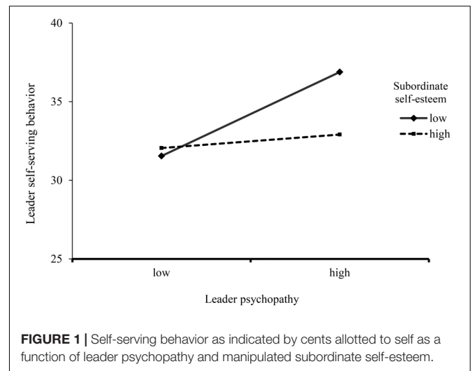
FIGURE 1 | Self-serving behavior as indicated by cents allotted to self as a function of leader psychopathy and manipulated subordinate self-esteem.