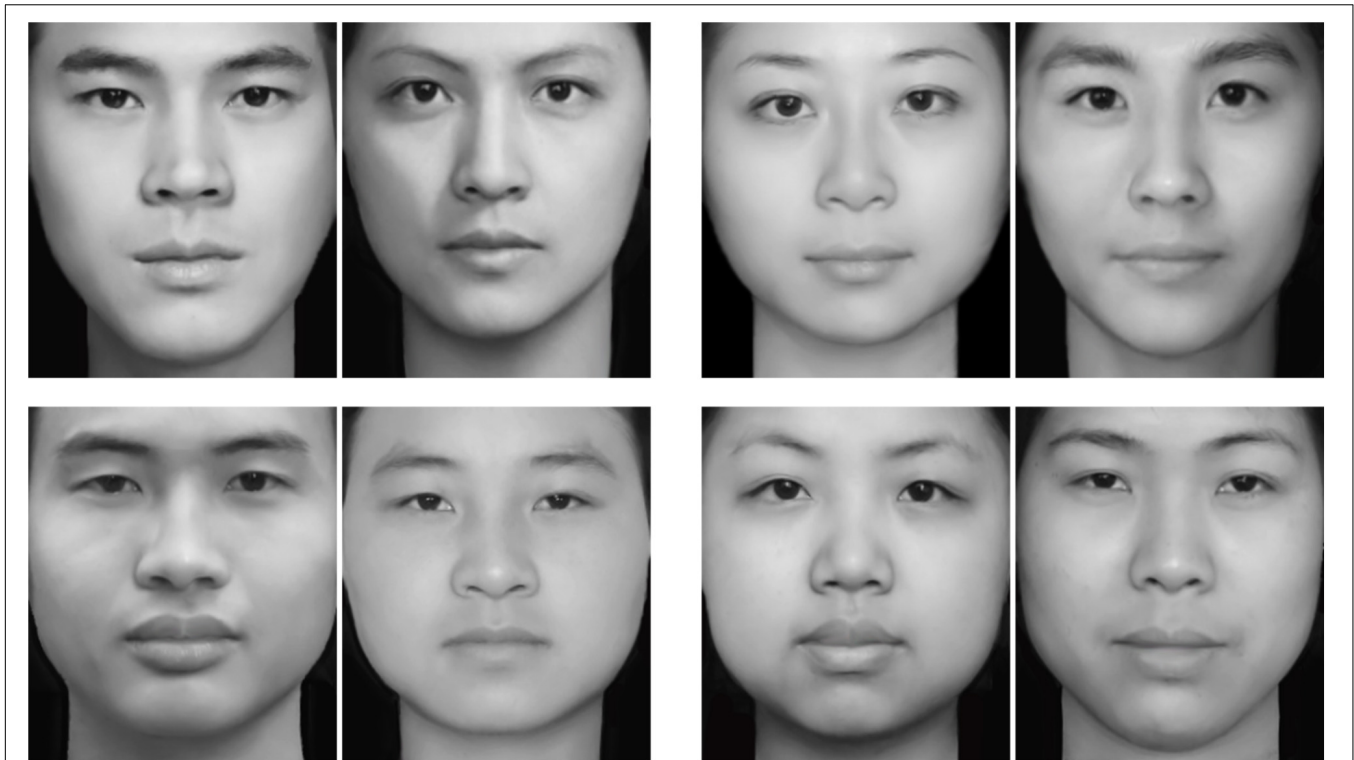
FIGURE 1 | Examples of more (first row) and less (second row) attractive face images. Masculine male faces were presented on the left and feminine male faces on the right (left group). Feminine female faces were presented on the left and masculine female faces on the right (right group).

invest the money and keep it. If you chose to invest your 10 cents, a feedback stimulus “1” appeared (meaning the partner returned 20 cents to the partner), or “0” (meaning the partner kept the entire 40 cents) following a gray screen in the center of the screen. On the other hand, if you kept your cents, you could retain your current amount of money. (5) At the end of the task, you will get the remuneration equal to the amount accumulated.