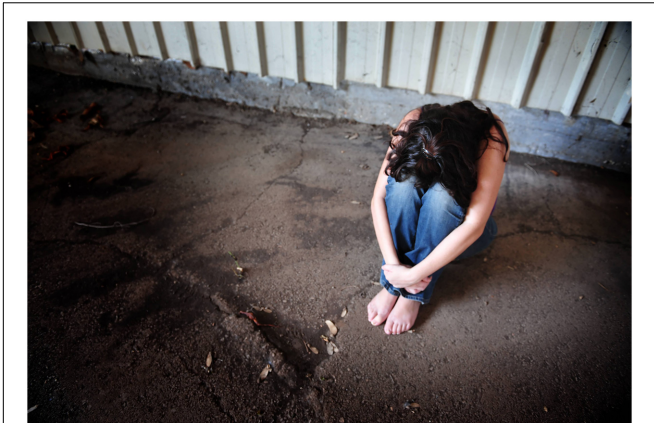
FIGURE 3 | Sample picture for passivity (© DPA 2015. Reprinted by permission).