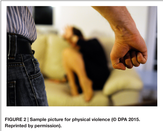
FIGURE 2 | Sample picture for physical violence.

an incident as sexual assault if the person concerned does not fit this stereotype. Therefore, they may not report the incident to the police or might face disbelief if they choose to disclose the incident to others.