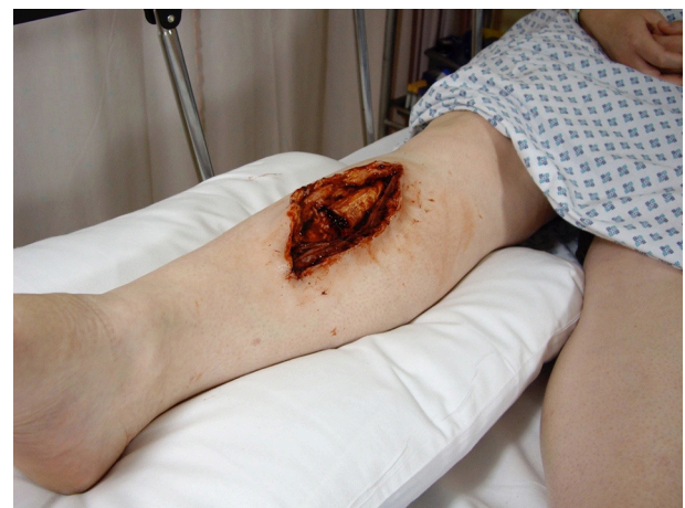
FIGURE 2 | Hybrid simulation of open leg fracture on Simulated Patient.

experiences of actual patients, preserving confidentiality while allowing the level of challenge to be adjusted at will (Kneebone et al., 2002, 2003, 2005, 2006a,b; Kneebone, 2006; Nestel et al., 2006).