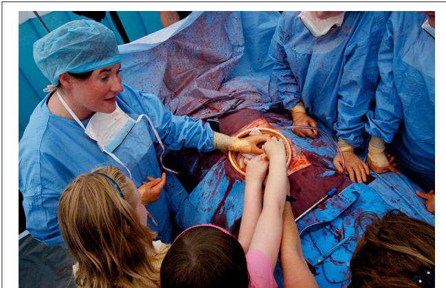
FIGURE 7 | Surgeon explaining operation to public audience at Cheltenham Science Festival.

performers and craftsmen outside surgery, carried out within the author's research group over an extended period. A broad corpus includes collaborations with performers in dance, jazz, classical music, magic, puppetry, juggling, theater and Formula One motor racing. This large body of data was generated with the aim of identifying exploring parallels between surgery and other areas of practice (craft and performance).