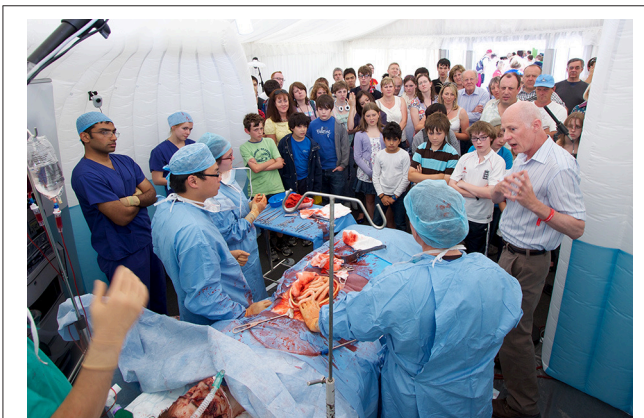
FIGURE 4 | Simulated operation with public audience at Cheltenham Science Festival.

and challenges of operating with a team of clinicians ( Video 1 ) (Kneebone et al., 2010; Kassab et al., 2011, 2012).