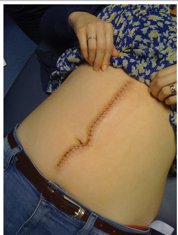
FIGURE 6 | Hybrid simulation of postoperative abdominal wound closure.

The author’s group has used simulation of this kind to connect with worlds outside medicine. This offers new possibilities for dissolving the restrictive frame that normally bounds clinical practice and simulation-based learning. While recognizing the centrality of technical mastery and fine motor skills, this approach also highlights the social aspects of performance,