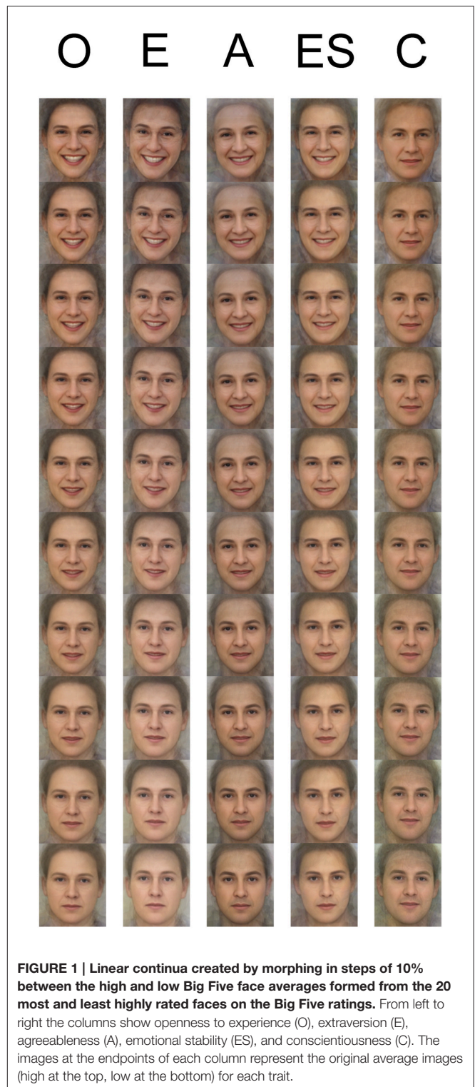
FIGURE 1 | Linear continua created by morphing in steps of 10% between the high and low Big Five face averages formed from the 20 most and least highly rated faces on the Big Five ratings. From left to right the columns show openness to experience (O), extraversion (E), agreeableness (A), emotional stability (ES), and conscientiousness (C). The images at the endpoints of each column represent the original average images (high at the top, low at the bottom) for each trait.

We then created five continua of 11 face images (see Figure 1 ) that varied between the high and low averaged images for each of the Big Five judgments separately by linearly morphing between the high and low averages using Psychomorph version 6 (Tiddeman et al., 2001; for a practical guide to Psychomorph morphing procedures, see Sutherland, 2015). These images were used to cross-validate the prototypes by testing whether the