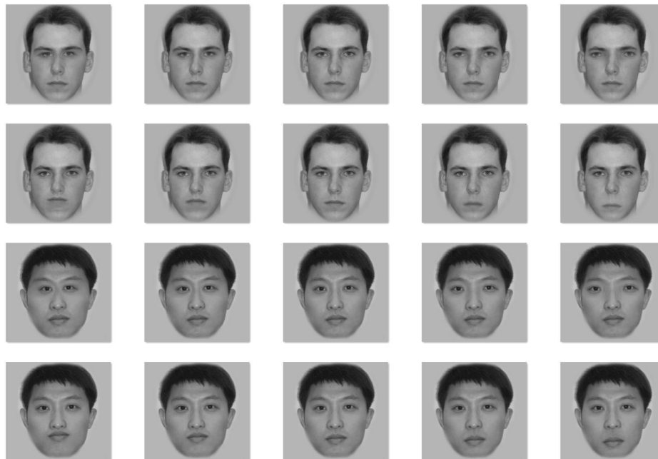
FIGURE 1 | Examples of spacing change between the two eyes (Rows 1 and 3) or between the nose and mouth (Rows 2 and 4) in a Caucasian face (Rows 1 and 2) and an Asian face (Rows 3 and 4). The middle face of each row is the original face upon which the manipulations were made. The leftmost face has the distance between eyes or between nose and mouth 10 pixels smaller than the original (the

Participants were asked to judge whether the two faces were the 'same' or 'different' with the instruction that a 'same' response indicates that the faces were judged to be physically identical. The same pairs presented two identical faces. The different pairs included three levels of difficulty in detecting the change: Easy, Medium, and Hard, with a 15-, 10-, or 5-pixel spacing difference, respectively, in the upper region (between the two eyes) or in the lower region (between the nose and mouth) of the two faces. On each trial, following a 150 ms fixation cross located in the screen center, a pair of photos was presented, side-by-side, with a time limit of 3,000 ms or until the participant pressed one of two keys responding 'same' or 'different', and this was followed by a 200 ms blank screen.