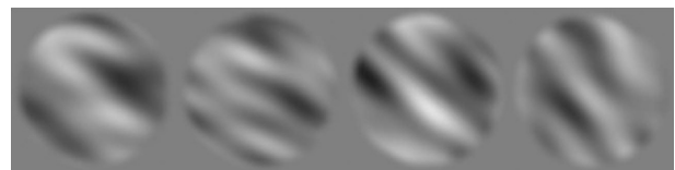
FIGURE 1 | Fractal rotation stimulus example. Stimulus is rotating clockwise. From this 4-frames sequence, it can be seen that a noise frame is resampled at every frame. An example movie of these stimuli can be viewed in Lagacé-Nadon et al. (2009; Movie 2).

Feature tracking requires observers to attentively track changes of a given property (e.g., position or orientation) and is therefore attention-based. Another attention-based motion task widely studied is multiple-object tracking (MOT). Performance to MOT tasks has been found to decline with age (Trick et al., 2005; Sekuler et al., 2008; Kennedy et al., 2009), which could reflect a decline of