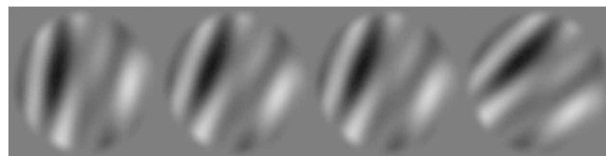
FIGURE 2 | First-order rotation stimulus. Stimulus is rotating clockwise. From this 4-frames sequence, it can be seen that a single noise frame is rotated in time. An example movie of these stimuli can be viewed in Lagacé-Nadon et al. (2009; Movie 1).