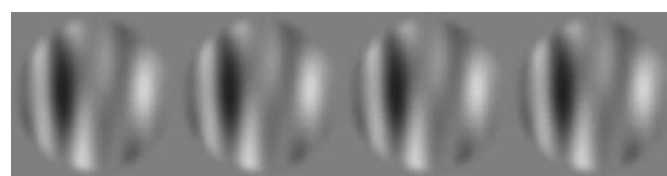
FIGURE 4 | Example of a vertical stimulus presented in the first-order control condition. A sequence of four presented frames on a single interval is shown. The same noise image is presented at all frames.

The temporal sensitivity functions to first-order and fractal rotation were band-pass and low-pass in nature, which is consistent with our previous findings (Lagacé-Nadon et al., 2009) that led us to conclude that first-order and fractal rotation stimuli are