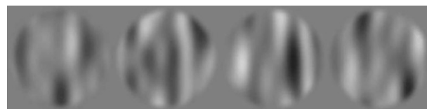
FIGURE 5 | Example of a vertical stimulus presented in the fractal control condition. A sequence of four presented frames on a single interval is shown. Noise is resampled on every presented frame. As can be seen, a flickering pattern is obtained.