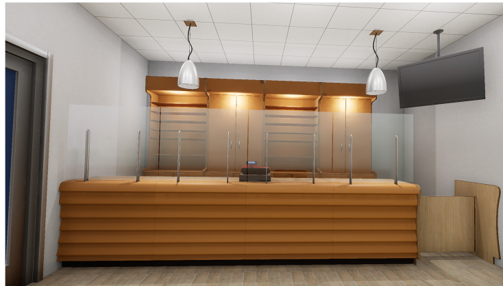
FIGURE 2 An empty tobacco store.