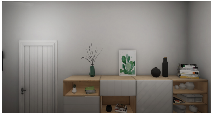
FIGURE 1 Neutral scenario.