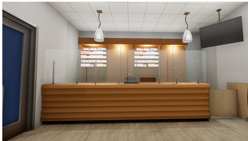
FIGURE 3 A tobacco store with cigarette packs.