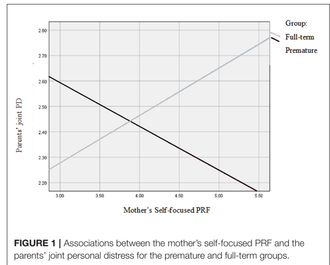
FIGURE 1 | Associations between the mother's self-focused PRF and the parents' joint personal distress for the premature and full-term groups.

The model predicting the parents' childrearing stress from prematurity moderated by the mother's and father's self-focused PRF was also significant [ F_{(6,61)} = 3.75, p < 0.01, R^2 = 0.27 ]. Prematurity had a direct effect [ B = -1.13, SE = 0.58, t_{(68)} = -1.96, p = 0.05 ], so that parents of premature infants reported less childrearing stress than parents of full-term infants. The fathers' self-focused PRF also had a main effect on the parents'