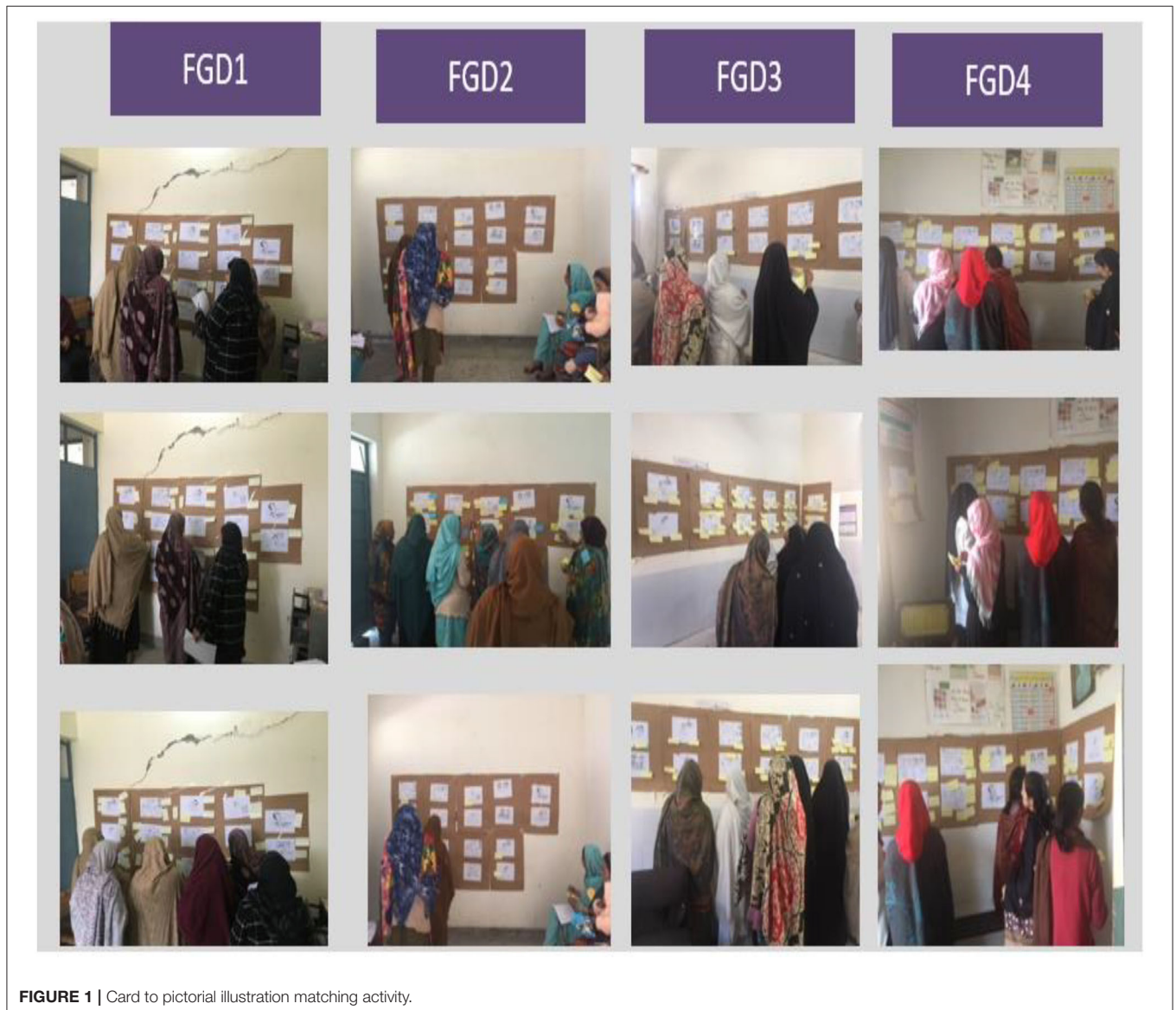
FIGURE 1 | Card to pictorial illustration matching activity.

The FGDs were audio-taped, transcribed into the local language, and translated into English with quality checks from research assistants at the study site by a professional translator. Data collection and analysis were conducted simultaneously. The qualitative data were analyzed using a framework analysis approach (Ritchie and Spencer, 1994).