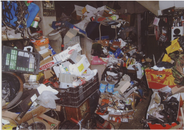
FIGURE 1 | Patient's house at beginning of medical intervention. Consent for publication was obtained.

On admission, in the mental status examination, it was observed that the patient was vigil, calm, and oriented; his mood