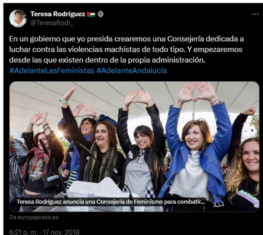
FIGURE 1 Posts by Teresa Rodríguez. Source: first image https://x.com/TeresaRodr_/status/1063914015791951873 ; second image https://x.com/TeresaRodr_/status/1063844581308096512 .