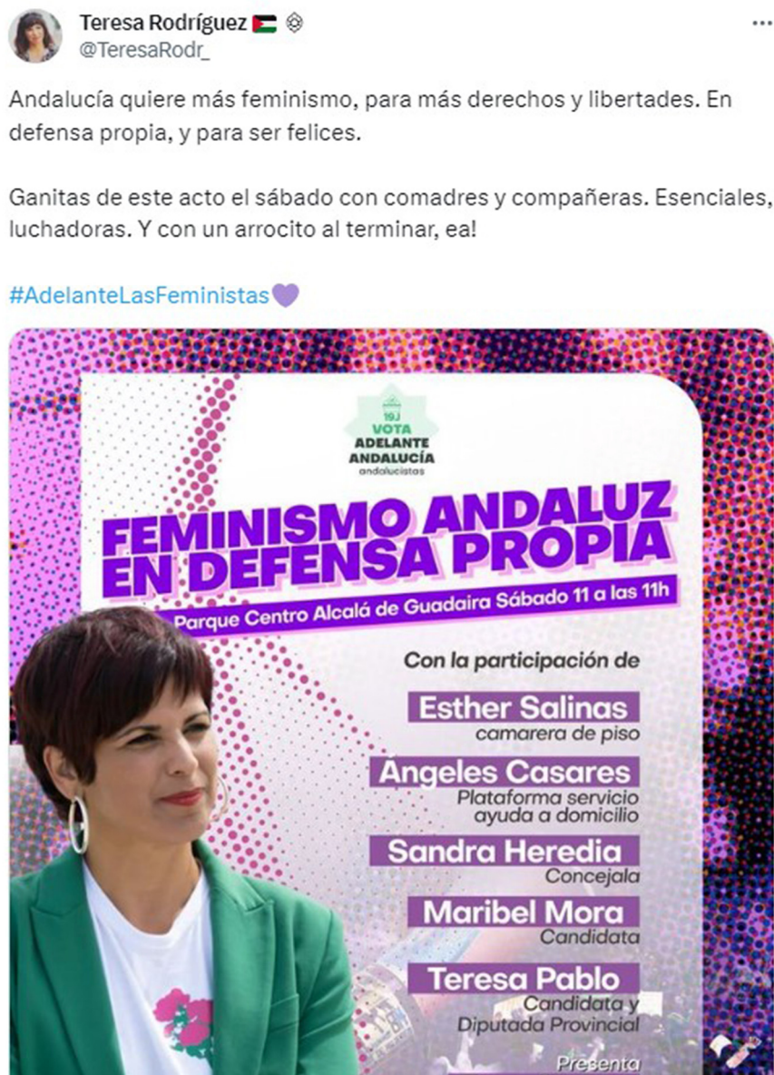
FIGURE 5 Combined use of the issue of Women and Inclusive Linguistic Strategies by Teresa Rodríguez. Source: case 11 in Table 9.

itself, an activity related with care, which we classify at a feminine issue in our operationalisation based on the theory). In both cases, they make use of collective nouns such as staff or professionals: “personal sanitario” or “profesionales de la sanidad pública” (see cases 6, 17, and 21 in Table 9). The subject of employment is usually a confrontational issue used particularly by parties in opposition. This can be seen in specific messages, for example, from the female candidate for AA and the male candidate for PSOE in 2022 (Juan Espadas) using gender doubling up such as “trabajadores y trabajadoras” (cases 3 and 13 in Table 9) or “vecinos y vecinas”, or conjugating general structures, such as “gente del metal” (case 9 in Table 9).