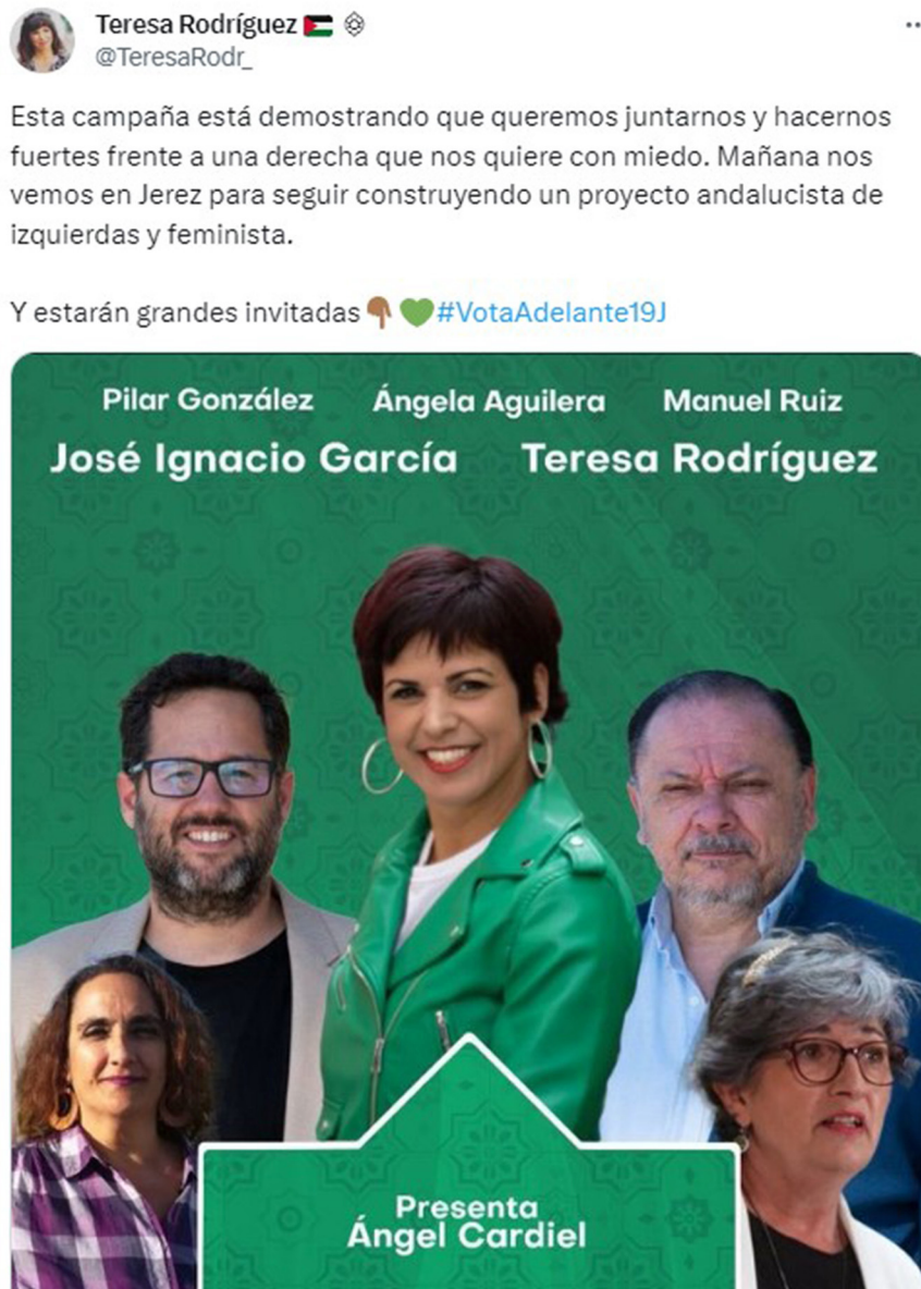
FIGURE 3 Applied use of the generic feminine by Teresa Rodríguez.

is. In fact, among right-wing parties this linguistic resource is practically non-existent. We would highlight here the isolated case of VOX (Figure 2) where Francisco Serrano uses gender splitting or doubling up in a strategic way to expose the counter narrative on gender violence.