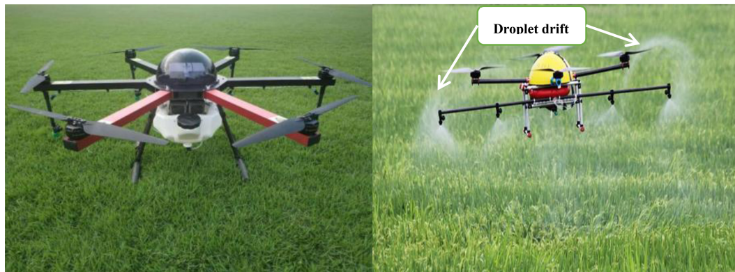
FIGURE 1 | Plant protection UAV and droplet drift phenomenon.