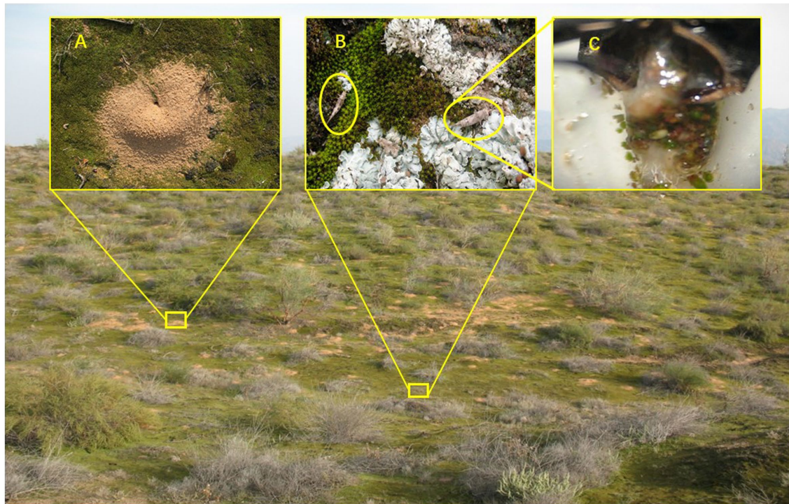
FIGURE 3 | Biocrust provided both a novel habitat and food source for soil arthropod [(A) numerous ant nest occurred on biocrust covered dune surface; (B) Haslundichilis sp. were feeding on lichen and moss; and (C) moss and lichen were found in Haslundichilis sp. foregut].

in crustal habitats (Rao et al., 2012; Jia et al., 2014). The effects of sand burial on biocrusts vary with the thickness and timing of the burial as well as the crust type. Shallow sand burial promotes biocrust growth, while thicker sand burial reduces PSII photochemical efficiency, chlorophyll a, and extracellular polysaccharide content of biocrusts. Long-term deep sand burial leads to the death of biocrust cryptogams (Wang et al., 2007). Microcoleus vaginatus Gom. can tolerate less than 1 cm of sand burial by growth moving upwards (Rao et al., 2012). Sand burial thicknesses tolerated by mosses and lichens are greater than those tolerated by algae (Jia et al., 2008). Specifically, moss- and lichen-crust can tolerate burial depths ranging between 1 and 4 mm by reducing respiratory carbon losses and upward growth (Zhao et al., 2017). Sand burial is also expected to modify the species compositions of fungal communities (Grishkan et al., 2015) and the greenhouse gas fluxes of biocrust-covered soils (Jia et al., 2008).