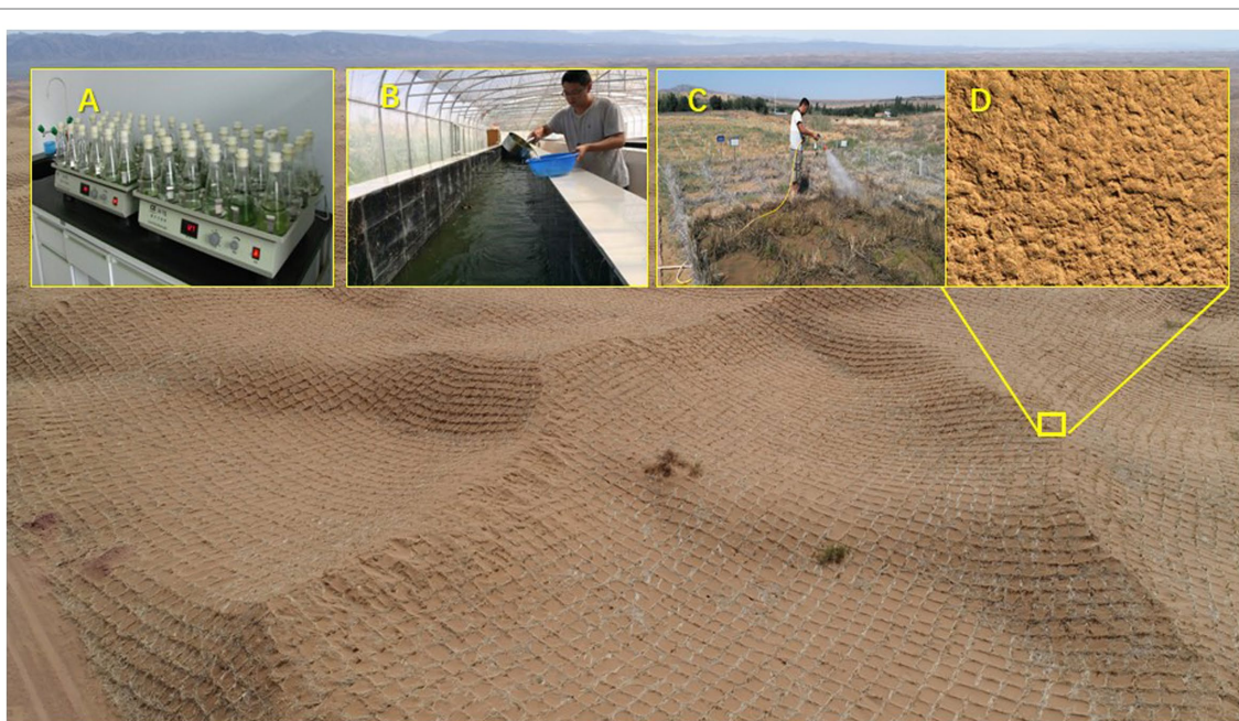
FIGURE 4 | Cultivated non-vascular plants were employed to form biocrusts on dune surface provisionally fixed by the sand barrier using straw checkerboard [(A) strain isolation and purification; (B) industrial scaled-up cultivation; (C) field spray-inoculation; and (D) cyanobacteria dominated crust after 1 year in the southeastern edge of the Tengger Desert].

As can be seen from the above research progress, biocrust is good indicator of desert ecosystem health and sustainable development, as well as bio-materials with great potentiality for restoration of land degradation since biocrust prevents soil erosion and facilitates the establishment of plant and soil biome, as well as maintains water balance. Furthermore, biocrusts can rapidly cover on sand dunes by inoculating and cultivating related nonvascular species and their high tolerate to harsh conditions, including exposure to intense UV radiation, drought stress, and various biotic and abiotic disturbances. These findings well explored biocrust roles in soil ecological, hydrological, landscape, and biogeochemical processes, as well as in desert ecosystem self-organisation, well supplementing our knowledge gap on biocrust in temperate deserts. The research progresses during two decades since 2000 were also reflected in research scales,