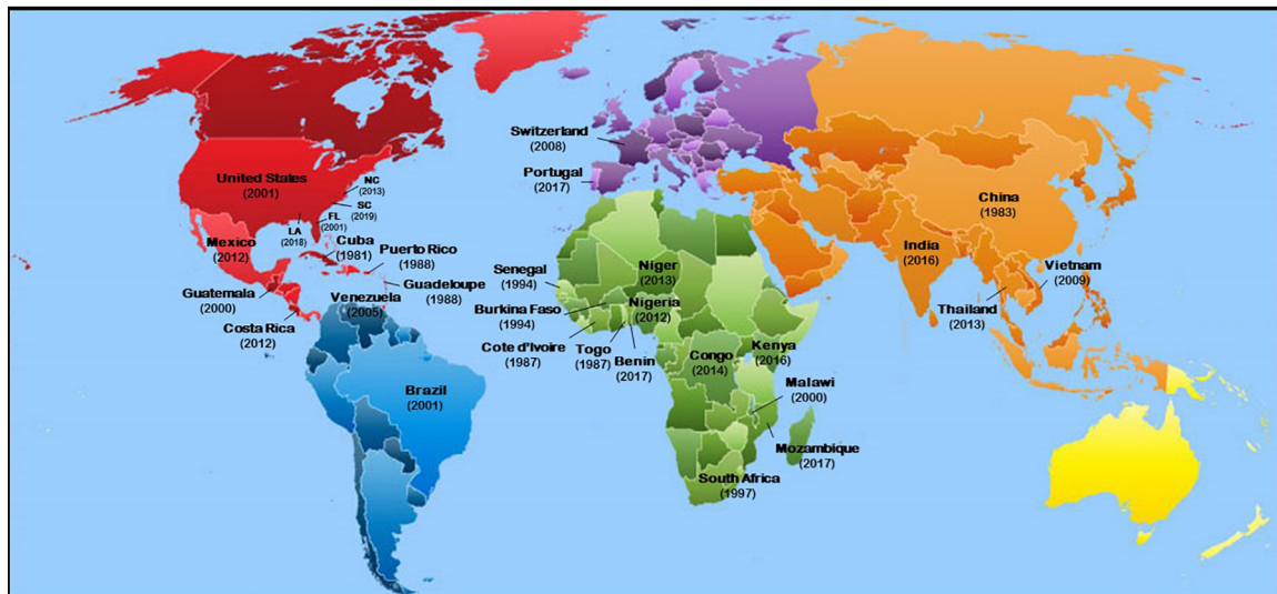
FIGURE 2 | Geographic distribution of Meloidogyne enterolobii across the world. Numbers in parenthesis in each country indicate the year in which the nematode was reported.

narrow tails with pointed tips, and distinct hyaline tail termini (Rammah and Hirschmann, 1988; Brito et al., 2004).