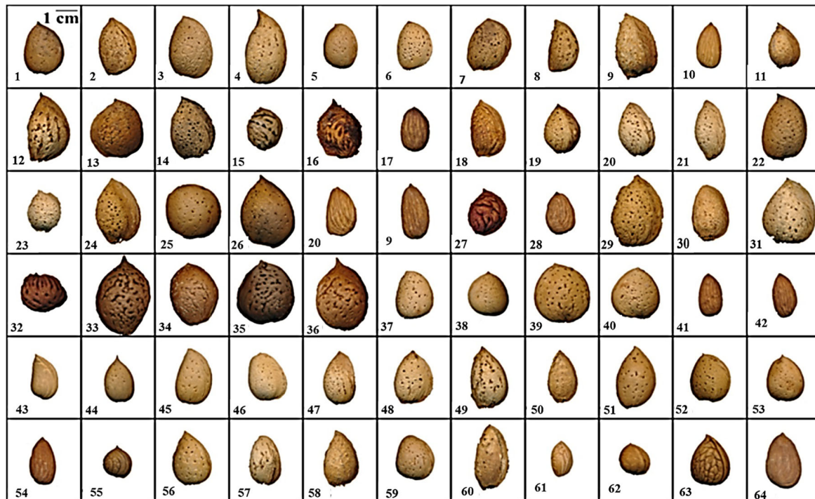
FIGURE 1 | Nut and kernel morphologies for an intra- and interspecific almond breeding germplasm. (Identifying numbers refer to the first column of Table 1 ).