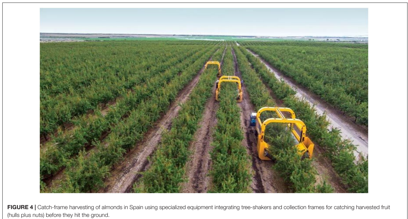
FIGURE 4 | Catch-frame harvesting of almonds in Spain using specialized equipment integrating tree-shakers and collection frames for catching harvested fruit (hulls plus nuts) before they hit the ground.