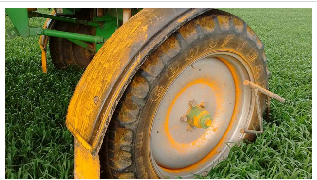
FIGURE 2 | Wheat yellow rust contaminated equipment early in the growing season (September 2017) in Los Cisnes, La Carlota, Córdoba province, Argentina.

Due to its polycyclic nature, SR epidemics can reach high infection rates in SR susceptible wheat cultivars, especially when temperature and relative humidity are favorable for disease development. Combined, temperature and relative humidity regulate several critical stages of the Pst life cycle such as spore germination, infection, latent period, sporulation, spore survival, and host resistance, all of which influence epidemic onset (Rapilly, 1979; Chen et al., 2014; Ma et al., 2015; Grabow et al., 2016). In Luxemburg, a threshold-based weather model for predicting SR infection indicated that temperatures between 4 and 16°C, a minimum of 4 continuous hours of relative humidity >92%, and rainfall ≤0.1 mm accurately predicted SR infections (El Jarroudi et al., 2017). In France, de Vallavieille-Pope et al. (1995) observed that SR infection on wheat seedlings required 3.5 h of minimal leaf wetness duration at 12°C.