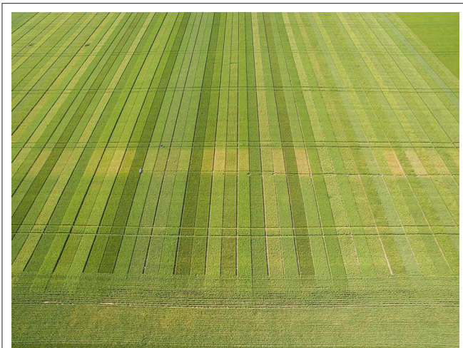
FIGURE 3 | Drone image of stripe rust wheat variety trial. The yellow transverse belt corresponds to different commercial varieties of bread wheat that received no fungicide application.

2019; Liu et al., 2019; Mu et al., 2019; Rahmatov et al., 2019; Saleem et al., 2019; Wamalwa et al., 2019; Xu et al., 2019; Zeng et al., 2019; Zhang et al., 2019; Ramachandran et al., 2020), the development of commercially available resistant cultivars will still need several years and considerable investment in many countries (Solh et al., 2012; Chaves et al., 2013; Ellis et al., 2014; Beddow et al., 2015). Besides, genetic improvement in search of resistant wheat cultivars is not carried out equally in the different wheat producing regions with different climates.