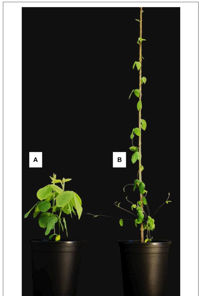
FIGURE 1 | Illustration of phenotypic comparison between G. max (A) and G. soja (B).

multiple origin hypothesis states that G. max was domesticated from G. soja during multiple events between 5,000 and 9,000 years ago. The complex hypothesis incorporates the results from two recent studies (Kim et al., 2010; Li et al., 2014), with a G. soja/G. max complex first diverging before multiple domestication events. The estimated age of the G. soja/G. max complex is 0.27 million years ago (MYA) (Kim et al., 2010) by whole genome comparison of one wild soybean ecotype to one soybean cultivar, or 0.8 MYA (Li et al., 2014) by pan-genome comparison of 7 wild soybean ecotypes. In this last hypothesis, the domestication would have stemmed from an already diverged G. soja/G. max complex (Sedivy et al., 2017). Individuals from either soja or max subpopulation were closely clustered based on their geographic origins (Zhang et al., 2015, 2016). A possible explanation could be that the early-domesticated G. soja or G. soja/G. max complex spread from China to Korean and Japan, and subsequently underwent varying degrees of domestication to meet local needs. Nevertheless, it is widely accepted that G. max was created from G. soja or G. soja/G. max complex through