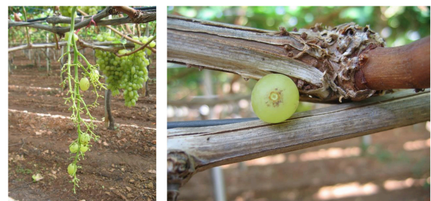
FIGURE 3 | Cluster of Thompson Seedless after the removal of the net to collect the abscised berries (left). Abscised berry with a dry stem scar (right).

Means followed by different letters in each column are significantly different (REGWQ, P \leq 0.01 ). 1 Eth 10, ethephon at a concentration of 1445 mg/L; 2 Eth 20, ethephon at a concentration of 2890 mg/L; 3 values in N.