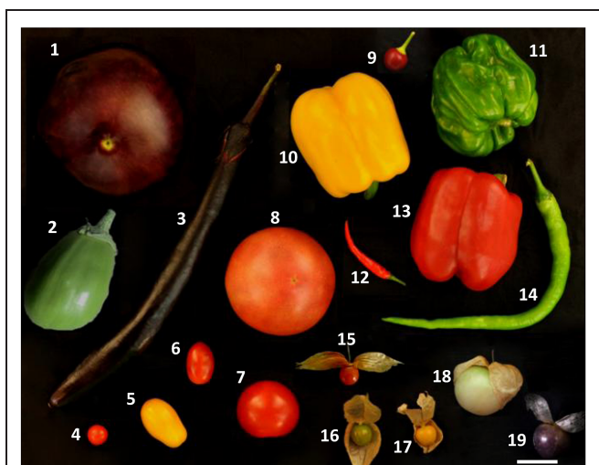
FIGURE 1 | The diverse variations of fruit morphology in the Solanaceae family. (1–3), Solanum melongena ; (4), Solanum pimpinellifolium ; (5–8), Solanum lycopersicum ; (9–14), Variants of Capsicum annuum ; (15), Physalis alkekengi ; (16), Physalis floridana ; (17–19), Physalis philadelphica . The Chinese lantern in Physalis spp. was opened to show the berry inside. Bar = 1 cm.