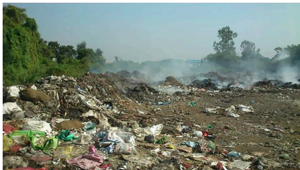
FIGURE 2 | The Effect of Soil Pollution on the living (Baruah, 2020).

Contaminants in the soil can also directly enter the human system through contact with the skin or inhalation of polluted soil or dust. In the same vein, water pollution has a negative impact on the viability and sustainability of water resources, as well as the proper growth and development of fish and other aquatic organisms, which are considered as important food sources (Figure 4). These all lead to a state of vicious cycle. Animals consume the contaminated fish and plants as well as drink the contaminated water leading to serious threat to their health and sustainability as well as disruption in the predator–prey interactions. The pollutants continue to travel up the food chain until they get to humans who eat the food and experience