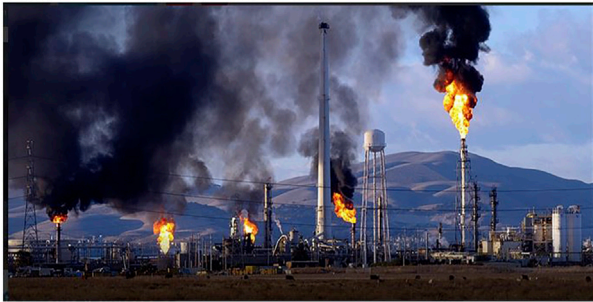
FIGURE 1 | Typical pollution of the environment from a refinery ( https://africanclimaterporter.com/2019/06/05/environment-day-climatologist-tasked-industry-company-refinery-owners-in-african-on-mandatory-trees-planting-and-reduce-polluting-the-atmosphere/ ).

Some of the common environmental pollutants include toxic metals such as lead (Pb), cadmium (Cd), mercury(Hg) and arsenic (As), as well as polycyclic aromatic hydrocarbons (PAHs), polychlorinated biphenyls (PCBs), pesticides and diesel exhaust particles among others (Anetor et al., 2008; Mojiri et al., 2019). Some of the common exposure sources of these pollutants and their health effects are listed in Table 1 .