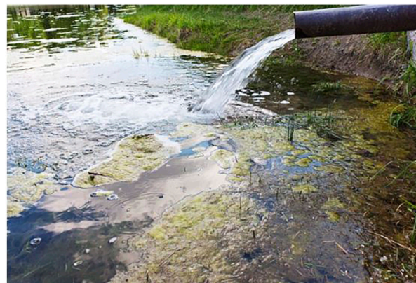
FIGURE 4 | Water pollution ( https://www.openaccessgovernment.org/water-company-fined-for-unpermitted-Pollution/48105/ ).

deleterious effects on their health as well their behavior and productivity (Chang et al., 2019; Warra and Prasad, 2020). This was classically manifested in the well-known Minamata disease; an environmental epidemic in Minamata Bay, Japan, caused by methyl-mercury poisoning by residents who ate a considerable amount of fish contaminated with wastewater discharged from a chemical company (Murata and Karita, 2022).