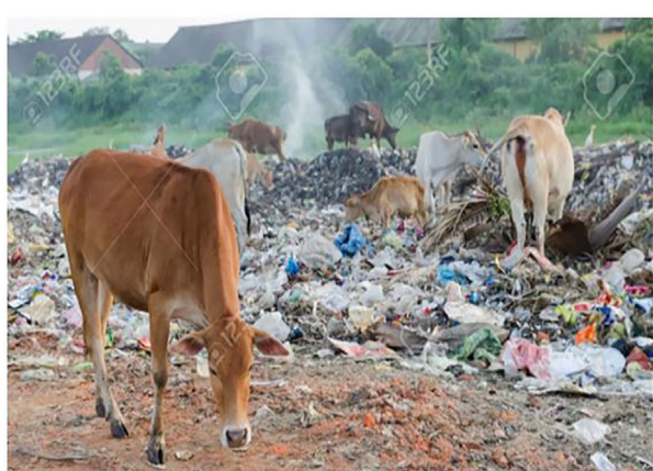
FIGURE 3 | Animals in a Polluted environment grazing on polluted soil.