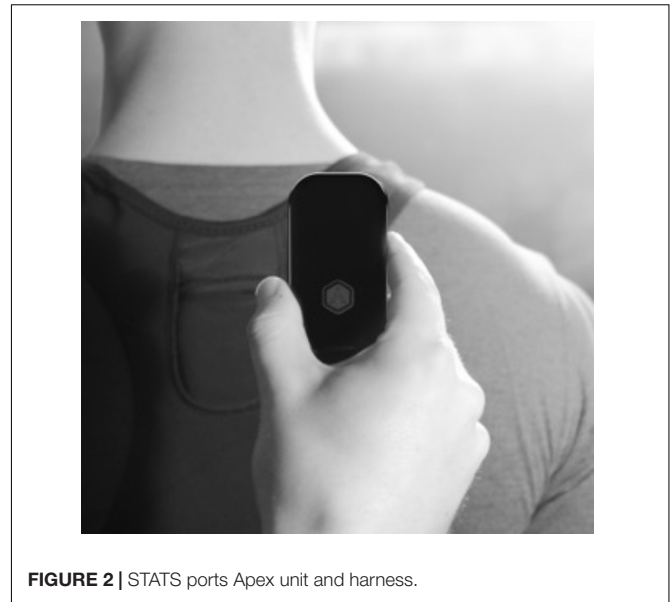
FIGURE 2 | STATSports ports Apex unit and harness.

The Apex units (10 and 18 Hz) were turned on about 10–15 min before the beginning of the test, while the subjects were familiarized with the equipment as well as the protocol procedures. Apex units present the following characteristics: dimension 30 mm (wide) \times 80 mm (high), weight 48 g, 100 Hz gyroscope, 100 Hz tri-axial accelerometer, and 10 Hz magnetometer. Prior to the experiments, both Apex unit models (Apex 10 and 18 Hz, STATSports, Northern Ireland) were placed on the back of the participant, midway between the scapulas ( Figure 2 ). Apex 10 Hz is a multi-GNSS augmented unit, which is capable of acquiring and tracking multiple satellite systems (e.g., GPS, GLONASS, Galileo, BeiDou) concurrently to provide the best possible positional information. In contrast, Apex 18 Hz units have a higher sampling frequency than Apex 10 Hz, but its acquisition system is based only on GPS. GNSS data (speed and distance) recorded by the units were downloaded and further analyzed by the STATSports Apex Software (Apex 10 Hz version 2.0.2.4 and Apex 18 Hz version 5.0, respectively).