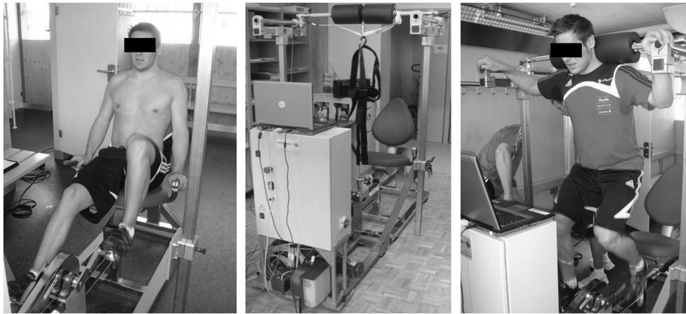
FIGURE 3 | Eccentric ergometer custom built for the Swiss National ski-team, capable of providing loads up to 2000 W. As shown, this ergometer can be used in a sitting and in a standing position (with permission from Hoppeler, 2014).

still limited number of studies is given by LaStayo et al. (2014). He also provides details of the ramping protocols for moderate load eccentric exercise that his research group has given the acronym RENEW (for Resistance Exercise via Negative Eccentric Work).