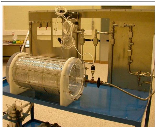
FIGURE 2 | A photograph of a typical radon exhalation chamber at SNOLAB. The sample material is placed in the cylindrical chamber where the radon progeny are accumulated for several ^{222}\text{Rn} half-lives after which the progeny are collected in a Lucas cell which is then used to count the photons from the alpha interactions [30].

can be collected inside a radon exhalation chamber for several half-lives of the ^{222}\text{Rn} and then counted directly with a radon detector (e.g., Durrige RAD7 [25]) or using alpha spectrometry. These measurements provide radon exhalation rates in units of \text{Bq m}^{-2} \text{s}^{-1} or \text{Bq kg}^{-1} \text{s}^{-1} . A typical radon exhalation collection chamber system is shown in Figure 2 . The exhalation rates of typical construction materials for underground laboratories are shown in Table 2 , as can be observed, the rates can vary a lot, so one should choose their materials with the exhalation rate in mind when constructing a low background experiment.