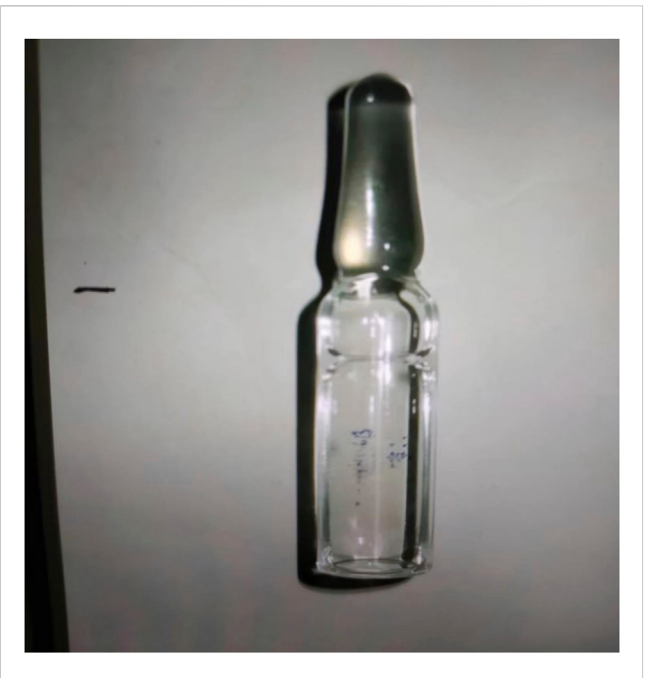
FIGURE 1 Xylazine ampule discovered beside the patient.