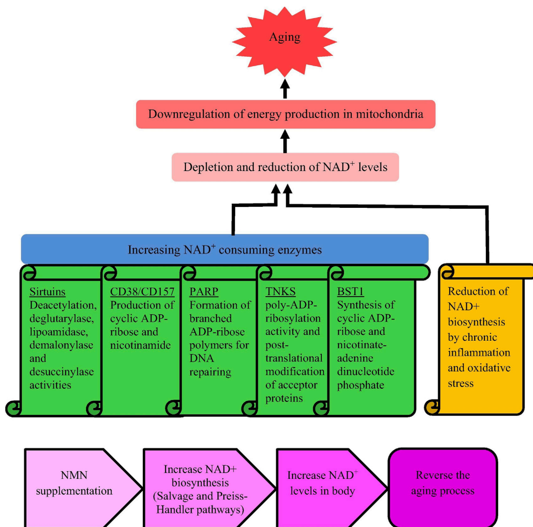
FIGURE 3 Causes for reducing NAD + levels when aging and mechanism underlying anti-aging activity of NMN. Notes: Nadeeshani, H, Li, J, Ying, T., Zhang, B, and Lu, J. 2021. Nicotinamide mononucleotide (NMN) as an anti-aging health product - promises and safety concerns. J Adv Res. 37: 267–278.

and its reduction can impair mitochondrial function and accelerate aging. Aging is characterized by decreased mitochondrial function, DNA damage, cognitive decline, osteoporosis, immune deficiency, etc. Supplementing with NAD + can alleviate these symptoms (Wang and Guo, 2015). Research has shown that NAD + precursors (NMN and NR) can maintain the number of melanocyte stem cells, enhance function, prolong mouse lifespan, and open up new directions for anti-aging science (Zhang et al., 2016). NAD+ and its precursors show potential in extending lifespan. The reasons for the decrease in NAD + levels during the aging process and the anti-aging mechanism of NMN are shown in Figure 3.