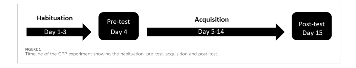
Figure 1 illustrates the habituation phase spanning from day 1 to day 3. Throughout this phase, the animals were allowed to explore the open apparatus for a total of 20 min each day. On day 4, a 20-min pre-test was performed to assess the animals' preference. The OPTO-MAX Auto-Track software documented various parameters, including the duration, overall activity count, ambulatory count, rest time, and distance covered by the animals in each chamber. A preference for the black chamber was observed among the majority of animals, necessitating the use of a biased approach.