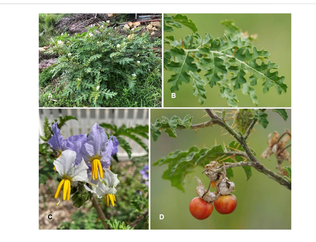
Solanum sisymbriifolium. (A) Habit; (B) Leaves; (C) Inflorescence; (D) Fully mature fruits.

Colombia, Ecuador, Paraguay, Peru, Uruguay, Venezuela). Oceania and Western Australia.