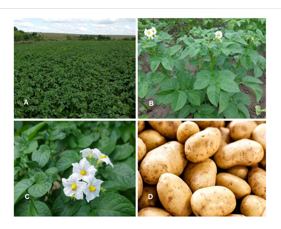
Solanum tuberosum. (A,B) Habit and leaves; (C) Inflorescence; (D) Fully mature fruits (Tashkent province, Qibray district, early potato farmer area).

Reproduction: By tuber, rhizomes and seeds.