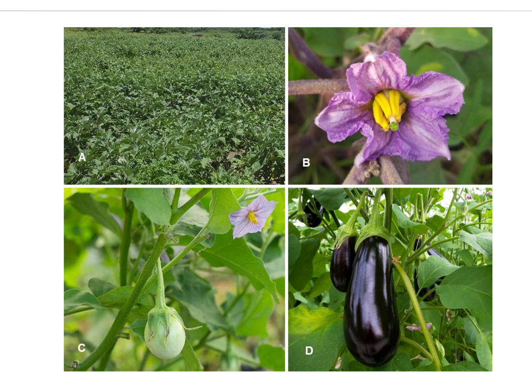
Solanum melongena. (A) Habit; (B) Inflorescence; (C) immature infructescence; (D) Fully mature fruits (Tashkent province, Qibray district, eggplant farmer area).

Phytochemistry and Pharmacology: The chemical composition of S. lycopersicum covers a broad spectrum of bioactive coumpouds and is very well documented, based mainly on phenolic compounds, carotenoids and alkaloids as the most present (Helmja et al., 2007; Iijima et al., 2009; Choi et al., 2011; Hövelmann et al., 2019). Choi et al. (2011) determined phenolic compounds viz. caffeic acidhexose isomer I, caffeic acid-hexose isomer II, caffeoyl-quinic acid, 5-caffeoylquinic acid, caffeoyl-quinic acid isomer, quercetin-3-apiosylrutinoside, quercetin-3-rutinoside, dicaffeoylquinic acid, tricaffeoylquinic acid, naringenin chalcone, and naringenin in different varieties of S. lycopersicum. According to Elizalde-Romero et al. (2021), S. lycopersicum is an important source of lycopene, whereas different preparation of the plant (tangerine tomato juice, red tomato juice, tomato paste, fresh tomato, and tangerine sauce) contained lycopene in both forms, as cis-, and trans-lycopene. All parts of this plant, including fruits, leaves, and stems, contain steroidal glycoalkaloids as a-tomatine and dehydrotomatine (Ostreikova et al., 2022).