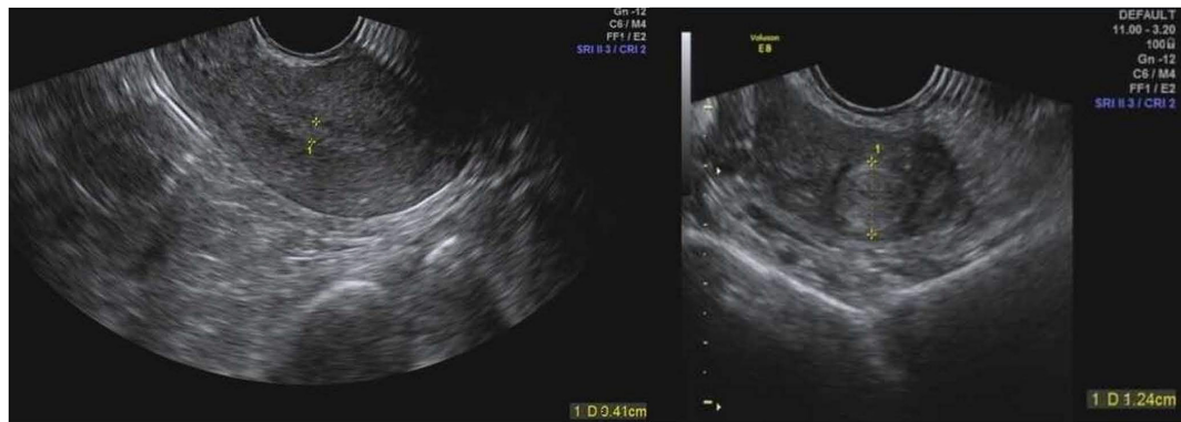
FIGURE 1 | Uterus ultrasound pictures.