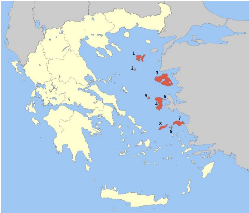
FIGURE 1 | Geographical location of the study area (Islands in red). Collection sites of the information are as follows. (1) Lemnos, (2) Agios Efstratios, (3) Lesvos, (4) Chios, (5) Psara, (6) Oinousses, (7) Samos, (8) Ikaria, (9) Fourni ( http://www.pvaigaiou.gov.gr ).

Interestingly, Hypericum perforatum L. and Verbascum ikaricum Murb. are kept in olive oil and used as solutions for wounds and sun burns. Pharmacists from Lesvos, Chios and Samos, still use these preparations as traditional therapy for skin wound healing in combination with modern treatments. Furthermore, clinicians from Lesvos use the powder of the root of Alkanna tinctoria for skin regeneration after injuries. They observed a combined antibacterial and antipruritic action, which reduces the healing time of the wound. It is important to note that Sideritis sipylea Boiss., Origanum sipyleum L., Thymus sipyleus Boiss., which are endemic and endangered plants are mostly used by the local people of Lesvos, Chios, and Ikaria with many curative purposes, especially for the infections of the respiratory and gastrointestinal tract as indicated from the UV values (Supplementary Table 1).