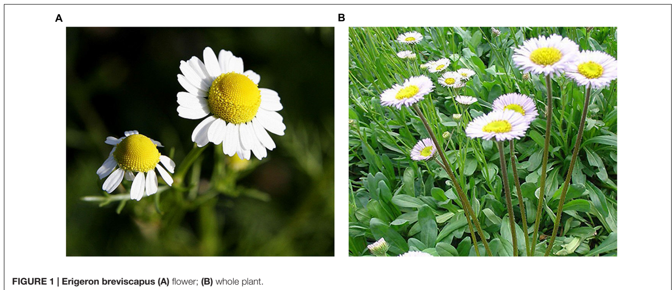
FIGURE 1 | Erigeron breviscapus (A) flower; (B) whole plant.