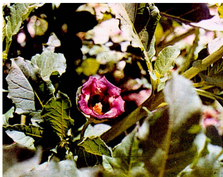
FIGURE 1 | The Chinese medicinal herb Scopolia tangutica Maxim.