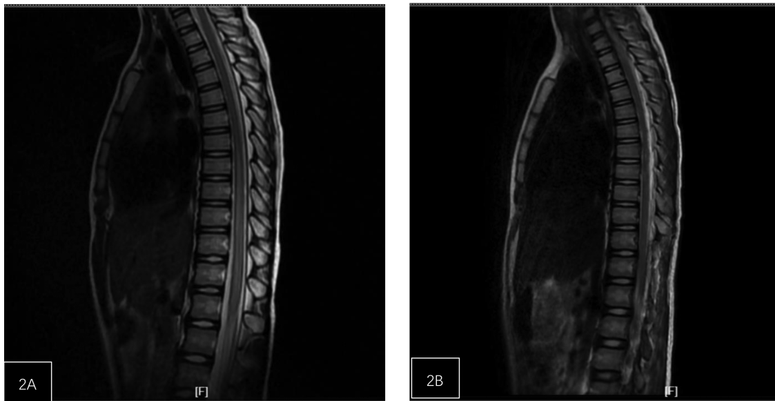
FIGURE 2 Patient, female, 8 years old, with lower back injury. (A) The spinal cord at the T7-L1 level is slightly enlarged with abnormal signal. (B) One-week post-operation, the range of abnormal signals in the spinal cord at the t7-L1 level has significantly decreased.