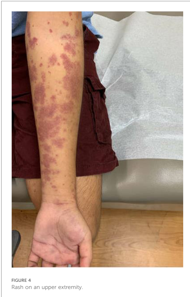
FIGURE 4 Rash on an upper extremity.

>6 months of recurrent urticaria with a leukocytoclastic rash, including during a 4-month stay in the USA and intermittently for the subsequent 18 months. Lab work confirmed hypocomplementemia with low classical complement proteins, including low C1q and positive anti-C1q antibody on repeated testing over time. A skin biopsy of the rash demonstrated leukocytoclastic vasculitis involving all small vessels. Urticarial flares were accompanied by arthralgias but not frank arthritis. He did not have cardiac, gastrointestinal, ocular, or renal manifestations. A previous rash, possible intermittent arthritis per parent, and flares of edema provided important clinical clues to the diagnosis of HUVS in this case. His gender and age at diagnosis are unusual but have been reported previously.