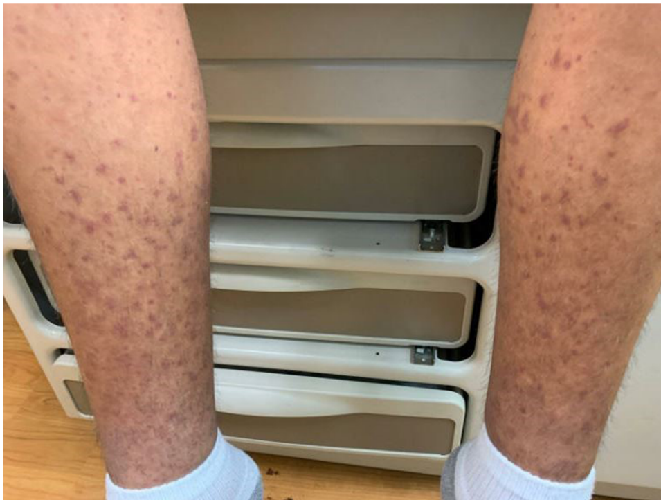
FIGURE 3 Rash on the lower extremities.

Further evaluation showed that Haemophilus influenzae B (Hib) IgG and Neisseria meningitidis IgG titers were not protective. Despite documented pneumococcal disease and purported pneumococcal (type unknown) vaccination 1 month before hospitalization, his pneumococcal antibody titers were protective against only 5 of 14 serotypes at a level of >1.3 \mu\text{g/ml} 3 months after infection. The number of protective antibody titers increased to 8 of 14 serotypes after the administration of a first pneumococcal polysaccharide vaccine, and then to 13 of 14 serotypes after a second pneumococcal polysaccharide vaccine was given. Cardiac screening noted a normal sinus rhythm on electrocardiogram (EKG) and normal echocardiogram. B-type natriuretic peptide (BNP) was normal at 6 pg/ml. Uveitis or episcleritis were not present on ophthalmic exam. Renal studies, including urinalysis, creatinine, and BUN, were normal. As symptoms were limited to pruritus, joint pain, and edema, antihistamines and non-steroidal anti-inflammatory drugs (NSAIDs) as needed were recommended for supportive care. Given the low C3 and CH50, the patient was administered pneumococcal polysaccharide, meningococcal, and Hib vaccines and started on lifelong amoxicillin prophylaxis.