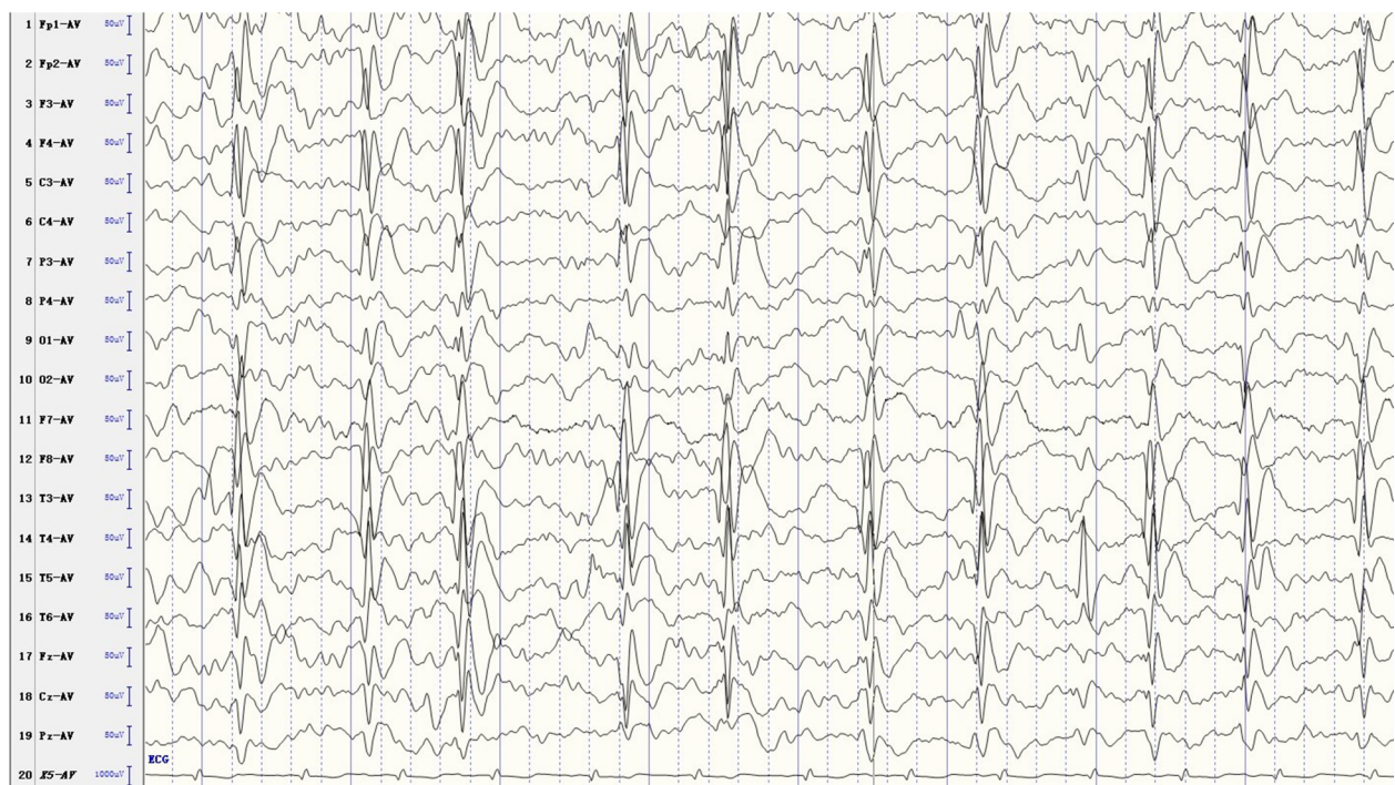
FIGURE 1 Scalp EEG of the ESES with concomitant frontal lobe discharges.

onset and the concomitant use of BZDs (all P < 0.05 ), as detailed in Table 1 . That is, children with a later onset of ESES and concurrent use of BZDs were more likely to respond positively to high-dose corticosteroid therapy.