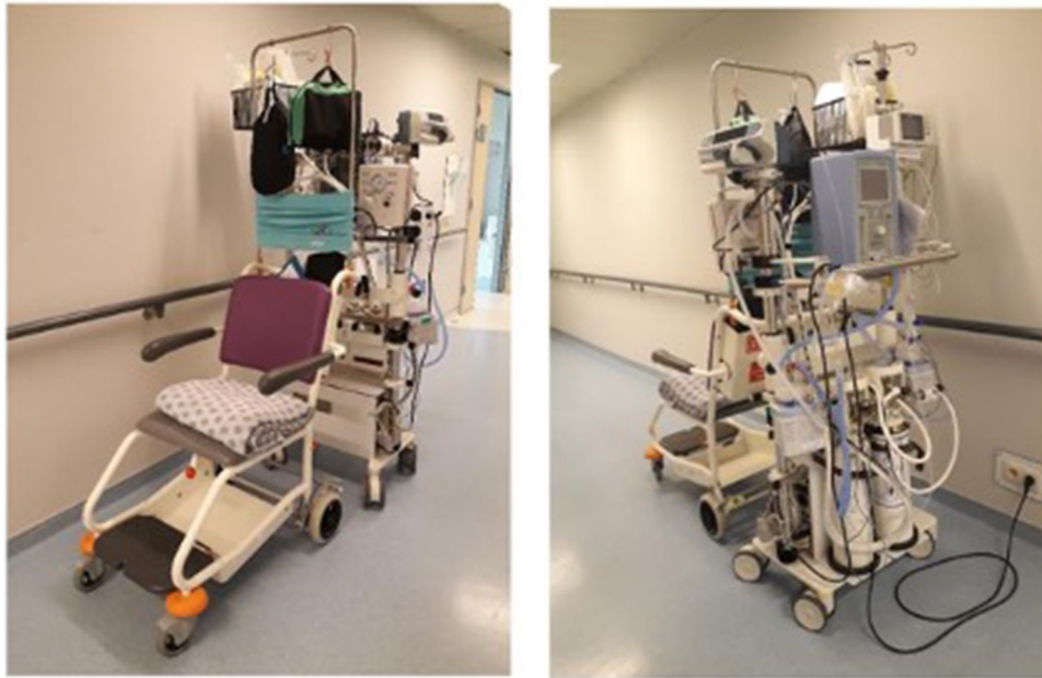
FIGURE 1 Picture of the Tandem.

the Tandem's gas supply. In cases when antibiotics or continuous IV glucose infusion was necessary, peripheral venous catheters were placed before departure. A nasogastric tube was also inserted if needed, based on the attending clinician's decision. After parents were comfortably accommodated in their beds or chairs, undressed neonates were placed against their bare chest secured by a tube-shaped holding top, and the parent-infant duo was covered by two layers of additional blankets. Finally, continuous skin temperature monitoring via a dorsal temperature probe was also started.