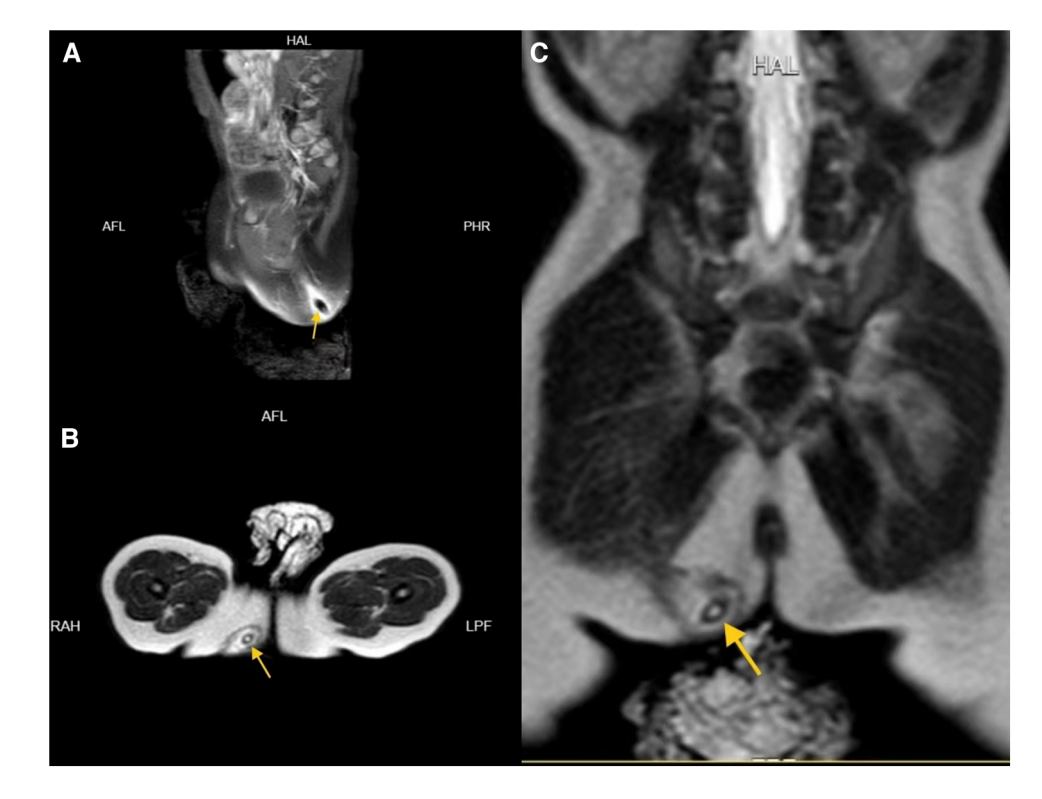
FIGURE 3 MRI images of patient 2 in the sagittal (A), horizontal (B), and coronal plane (C) showing the jujube pit (indicated by arrows).