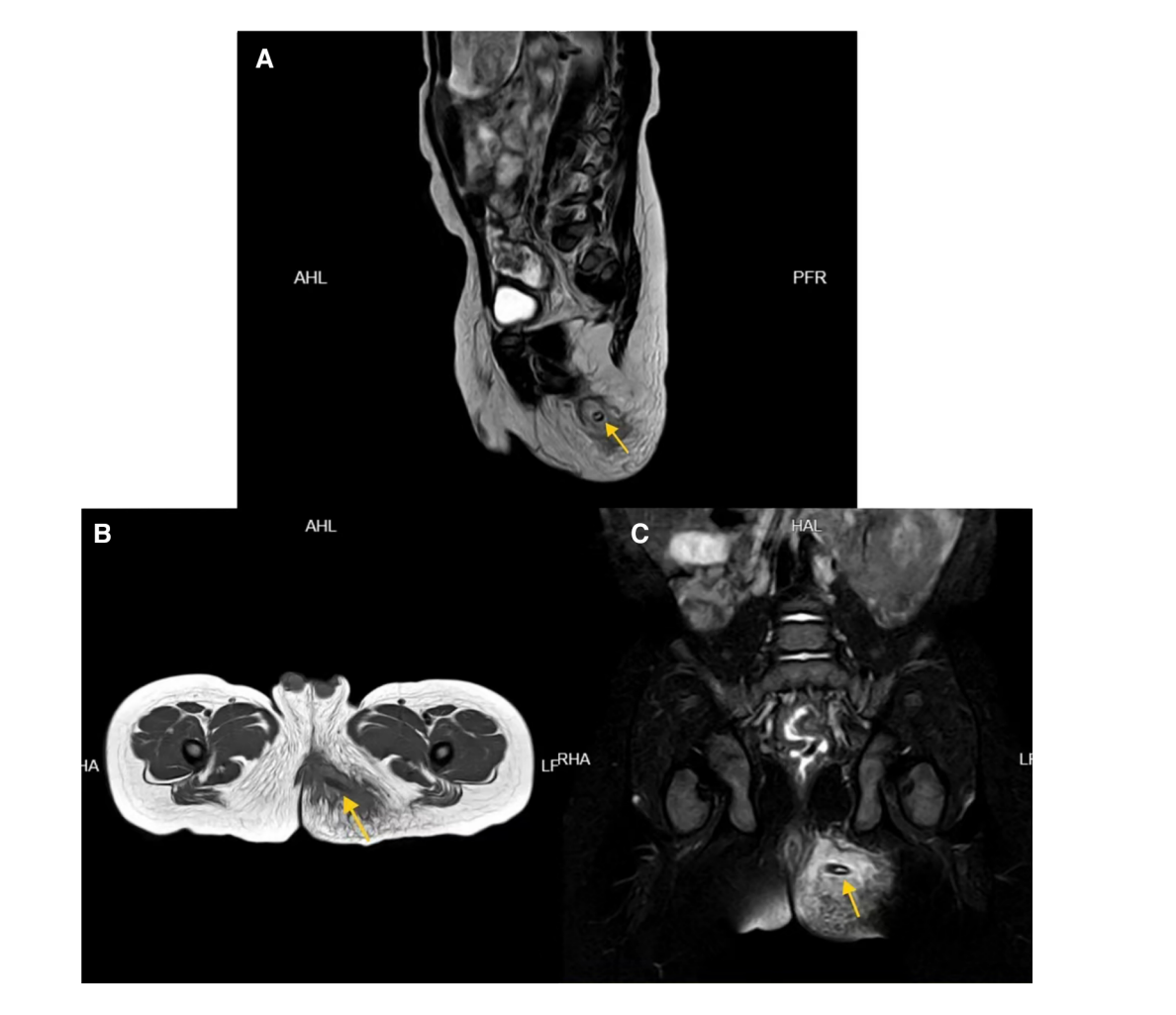
FIGURE 1 MRI images of patient 1 in the sagittal (A), horizontal (B), and coronal plane (C) showing the jujube pit (indicated by arrows)

Children's oral tendencies, especially during the oral stage, increase the risk of ingesting brightly colored jujubes. Communication challenges may obscure the medical history, posing a risk of overlooking rare causes like jujube pit impaction