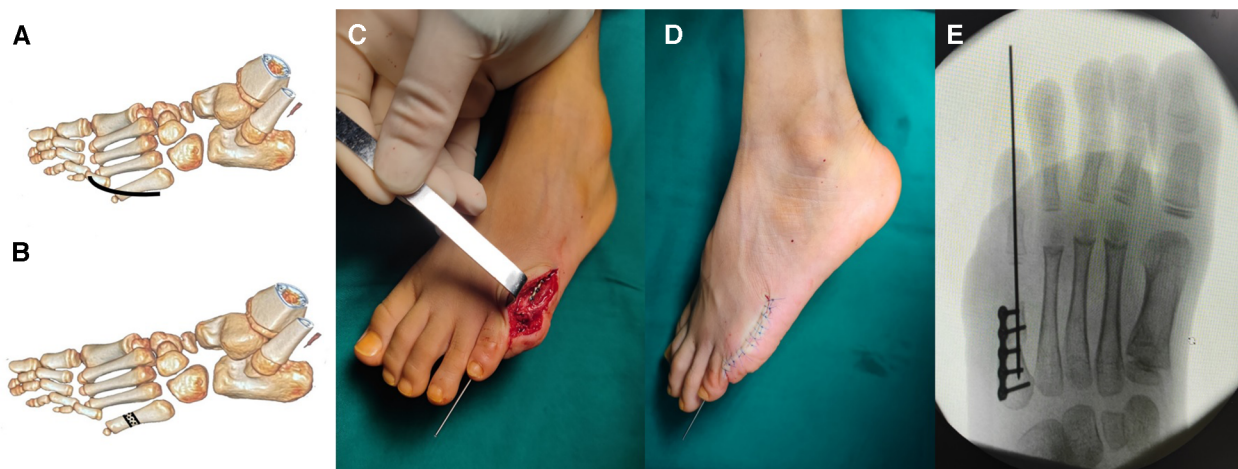
FIGURE 3 The metatarsal osteotomy procedure. The curvilinear incision was performed over the fifth MTPJ (A); the osteotomy in the metatarsal bone (B); after reduction of the MTPJ, the osteotomy was performed with fixation by the lock compression plate (C); the Kirschner wire was used to keep the stability of the MTPJ (D); the anteroposterior radiograph shows the reduction of the MTPJ (E).

10). In cases of dislocation, the excessive dorsiflexion force on the foot causes the metatarsal head to be pushed in a plantar direction during walking or running, which may cause foot pain (11). The force could destroy the plantar plate and aggravate the dislocation of the MTPJ.