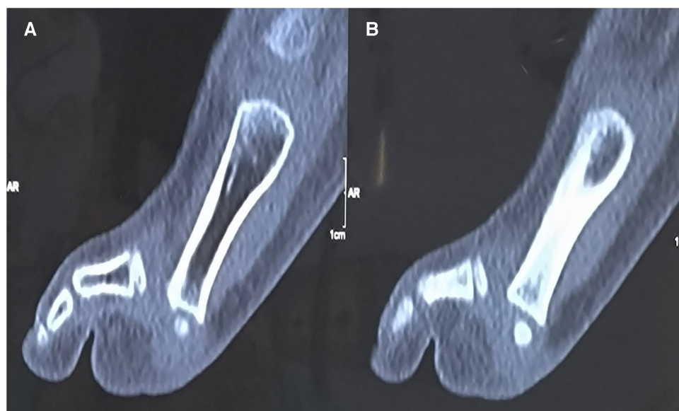
FIGURE 1 (A, B) Computed tomography shows the dislocation of the fifth MTPJ in the sagittal image.

Dislocation of the MTPJ mainly involves the forced extension of the foot, which is consistent with the injury sustained by the patient (7, 8). The dislocation of the MTPJ is mainly reported as a result of road traffic accidents, sporting accidents, falls, and the dropping of heavy objects on the foot. The lesion results in either hyperextension or hyperflexion of the MTPJ. The direction of the dislocation is most frequently dorsal as a result of the forced hyperextension of the joint (2). The fibrocartilaginous plantar plate located at the metatarsal head could endure compressive and tensile forces and increase joint stability. It is well known that the MTPJ is protected by an articular capsule and its associated collateral, dorsal, and plantar ligaments (1). Dislocation of the MTPJ may be a result of trauma, with injury to the plantar plate and collateral ligaments. Then, the plantar plate located around the metatarsal head could endure the compressive and tensile forces with the added joint stability (9,