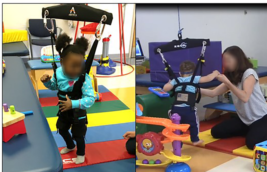
FIGURE 4 Examples of upright locomotor training with body weight support.

Training characteristics will be collected during therapy sessions as potential predictor variables for acquisition and retention of locomotor skill, including measures of error, movement index, postural control and movement variability. These will be measured using video coding of recorded therapy sessions using Datavyu video coding software (45). Error during prone locomotor training will be defined as the number of corrective turns generated by the child. Corrective turns are a change in direction less than 2 s following another turning movement. Error during upright locomotor training will be defined as the number of losses of balance. Analyses will be performed with total amount of error, and frequency of error normalized to the distance travelled (error rate). The number and rates of error will be measured using the crawling and walking training robots. Movement index is the percent of time moving during each therapy session. This variable will be calculated using IMU data. Postural control is the percent of time with the head lifted during crawling therapy sessions, and the percent of time spent in an upright posture during walking therapy sessions. This variable will be determined by video coding. Movement variability during crawling is the activities that engage the SIPPC assist mechanism, measured by the IMUs. Movement variability during walking is the number of different motor activities in which the child engages, determined by video coding.