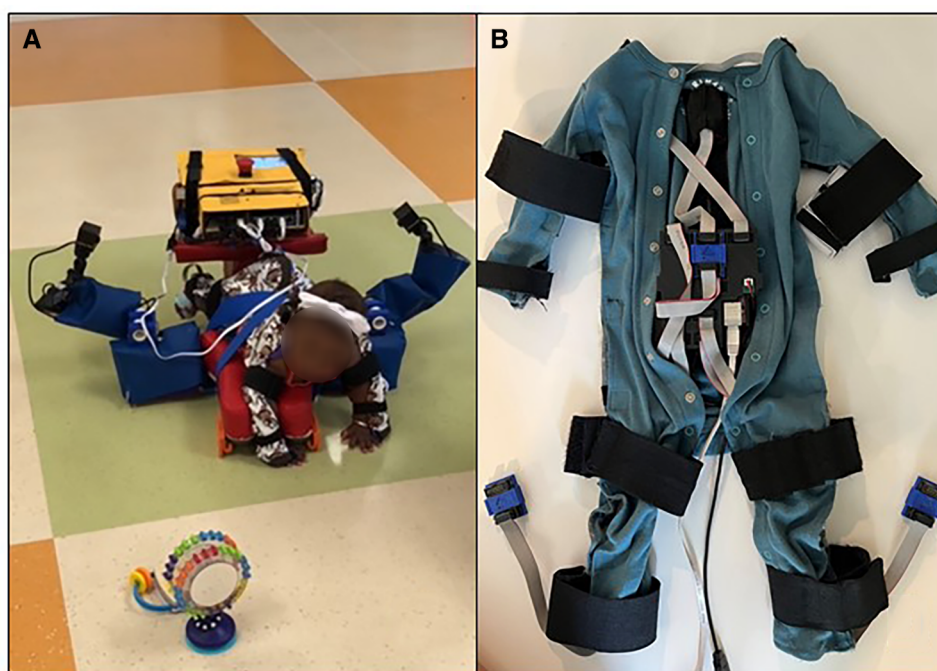
FIGURE 3 (A) SIPPC. (B) Motion capture suit.

Upright locomotor training sessions will occur at the CHOP main campus. Participants will receive upright locomotion training with dynamic weight support using the ZeroG Gait and Balance training system (Aretech LLC, Ashburn, VA) for each 30-minute therapy session (42). The dynamic weight support system continuously provides a constant amount of weight assistance but does not direct or constrain movement. Initial amount of weight assistance will be 50% of the infant's body weight. Weight assistance will be gradually reduced as postural control and coordination improve, but only when upright locomotion can be performed with the same (not greater) amount of therapist assistance at a lower level of weight support. Participants will be weighed once per month and weight support will be adjusted accordingly. The environment will be arranged to encourage active motor exploration and to promote error-generating experiences and variability in upright activities. The floor area within 3 feet on either side of the overhead track for a distance of 15 feet (approximately 90 square feet total) will be indicated by a thin rubber mat and arranged with pediatric toys to encourage walking, tailored to the child's motor ability and interests. This arrangement works well to keep children within the limits of the overhead track, provides ample space for motor play and