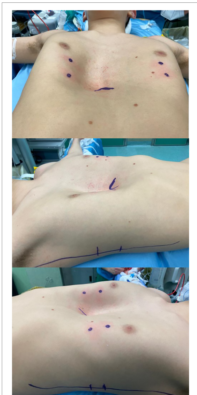
FIGURE 1 Preoperative valutation.

A 15-year-old boy affected by PE with severe asymmetric deformity of the chest wall was evaluated for elective corrective surgery ( Figure 1 ). He was asymptomatic except for shortness of breath during sport activity. Preoperative electrocardiogram,