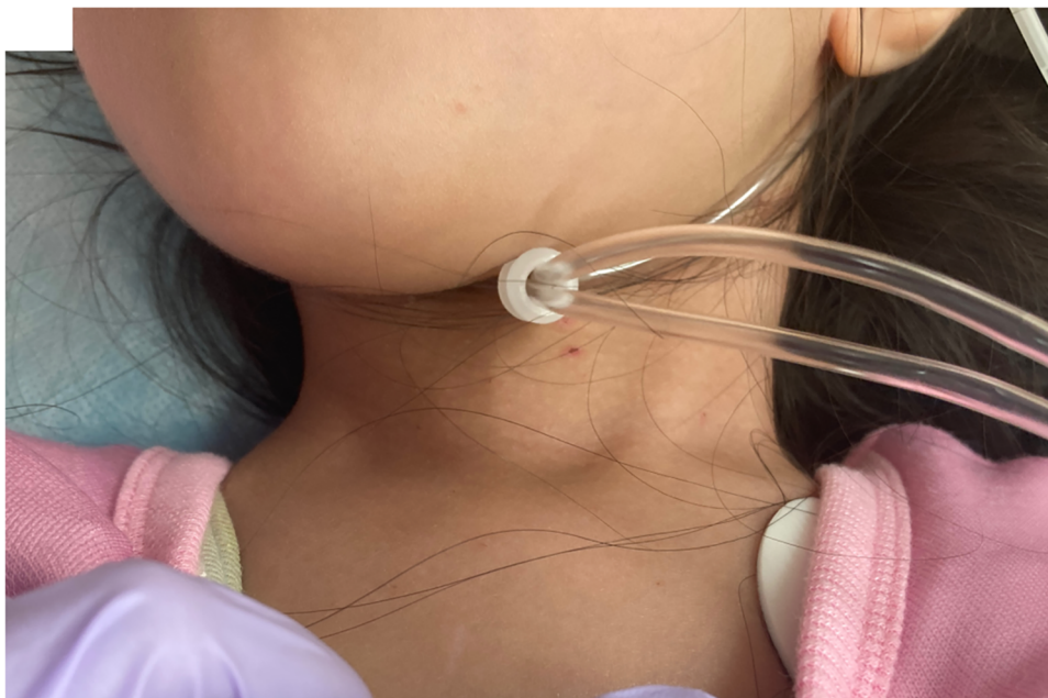
FIGURE 1 Photograph of the patient on admission showing an enlarged and homogeneous thyroid.