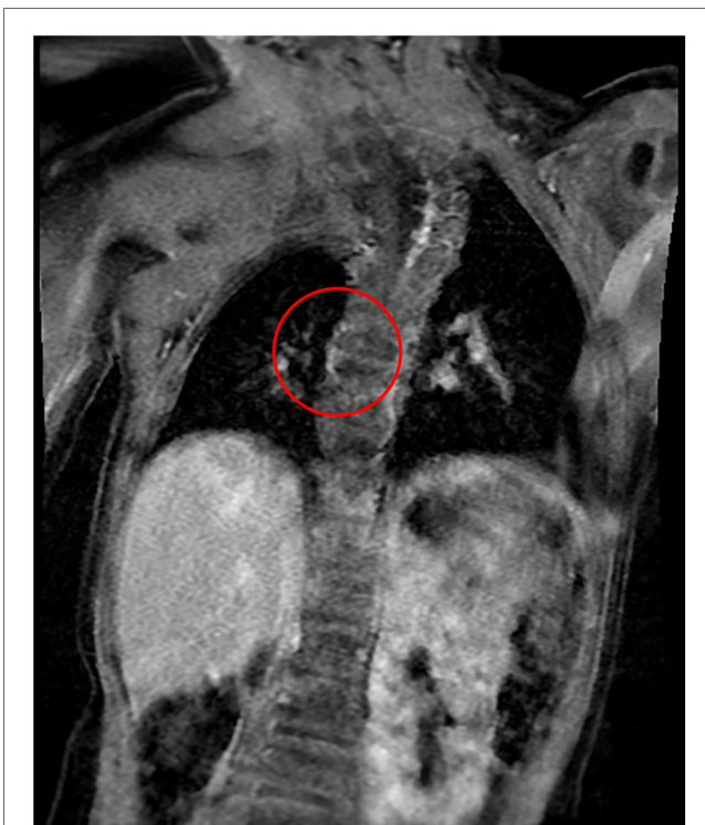
FIGURE 4 MRI scan 16 months after surgery (the circle shows no lesions).

After 12 months of follow-up, the patient showed any GI symptoms, and oral feeding was compliant. Sixteen-month MRI showed normal anatomy of the esophagus ( Figure 4 ).