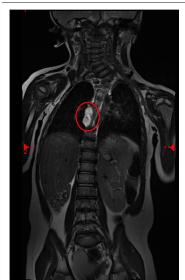
FIGURE 1 MRI scan of cystic lesions of the esophagus (circle: EDC at the D7–D9 level).

The postoperative evolution was uneventful. We removed the drainage, and the patient started oral feeding after 24 h from the surgery. She was discharged after 4 days without any complications. The histological report confirms the diagnosis of double cystic esophageal duplication (Figure 3).