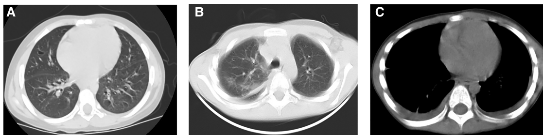
FIGURE 1 A 5-year-old boy had habit of drinking untreated water. CT of the lungs showed cystic areas (A), pulmonary exudation (B) and pleural effusion (C).

The diversity and lack of specificity of clinical symptoms, signs, and laboratory tests can easily lead to misdiagnosis. As shown in previous studies, paragonimiasis can be easily misdiagnosed as tuberculosis or cancer (10, 11); 6 cases had been misdiagnosed as tuberculosis, tumor, and viral encephalitis in our study. The radiographic findings, which presented in our results, are also found in other diseases, such as pneumonia, lung neoplasms,