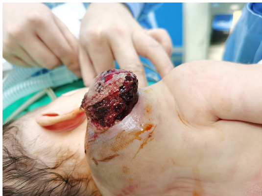
FIGURE 2 Tumor after 1 week of cefmenoxime treatment.