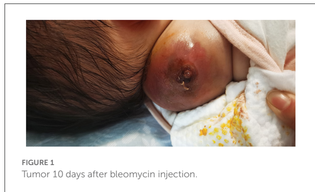
FIGURE 1 Tumor 10 days after bleomycin injection.

mg/kg. After treatment, the patient did not experience any typical drug reactions, such as fever, vomiting, abdominal pain, or diarrhea, and was discharged the next day after the injection treatment. 10 days after treatment, the tumor became red and swollen, and the surrounding skin began to rupture (Figure 1). Therefore, the patient was readmitted to the hospital. Considering that the patient's tumor may have had a drug reaction to the infection, she was given cefmenoxime 0.15g twice a day for anti-infection; however, there was no discernible improvement, and the necrosis continued to spread (Figure 2). Tumor resection was later performed, and the resected tumor was approximately 6.5 cm × 5.5 cm × 2.5 cm in size. The tumor was pathologically diagnosed as PMMTI (Figure 3). Immunohistochemical detection of the following monoclonal antibodies and oncogenes was assessed: CD3 (-), CD20 (-), CD79a (-), Desmin (partial +), CK (AE1/AE3) (-), CD34 (vascular+), CD31 (+), SMA(vascular+), S-100(-), ALK(-), INI1(present), CD99(+), Bcor(-), MyoD1(-), Myogenin(-), Ki-67(about 30%+), CD117(-), Synaptophysin (-), CD56 (partial +), CD30(-), Ki-67 (about 30%+), and Vimentin(+) (Figure 4). An outpatient follow-up MRI performed 1 month after the patient was discharged from the hospital, revealed no obvious tumor recurrence. During the telephone follow-up ~3 months after surgery, the wound had healed well, and no obvious tumor recurrence was detected.